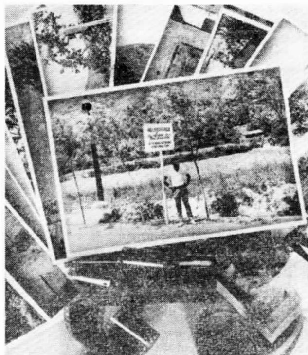
Photographs surreptitiously taken by the Indian spy Raghunath

Exposing the innumerable crimes of these foreign reactionary elements, the spokesman said that they were snooping around with ulterior motives, surreptitiously photographing, copying and stealing big-character posters; resorting to all kinds of sinister methods to collect large numbers of materials such as papers, journals, pamphlets and leaflets put out by the various Chinese revolutionary mass organizations; probing for inside information from our masses by posing as personnel from friendly countries; sneaking into our Party and government departments, people's organizations, schools and enterprises by posing as Chinese; and even