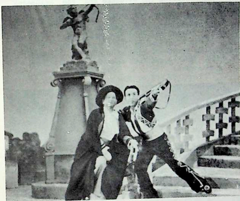
A performance of Rossini's "The Barber of Seville" by the Opera and Ballet Theatre

Prime Minister Adil Çarçani presented the programme of the new government, which was approved, as were the decrees issued by the Presidium since the last session of the Assembly.