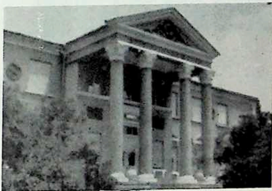
The Lenin-Stalin Museum in Tirana

The cost is £31.50 including postage, but 20% deduction is available if membership of the Albanian Society is quoted.