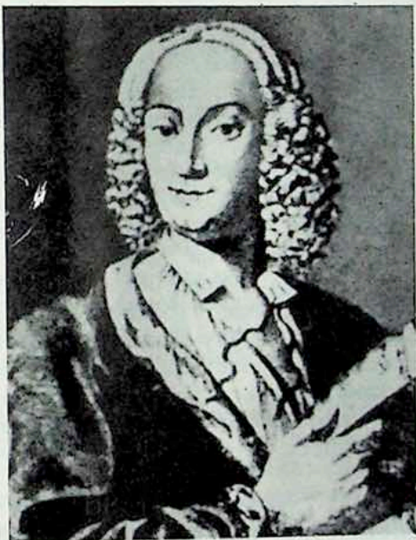
Antonio Vivaldi (1678-1741)

A distinguished place in the panorama of European music in the 18th century was held by Antonio Vivaldi. Among his many-sided activities (he was composer, conductor, brilliant violinist, teacher, opera director, etc.) he was the composer of an opera entitled "Skanderbeg". And this was certainly not accidental. The fame of the Albanians led by Skanderbeg had crossed the boundaries of time and space: the heroic resistance of our people against the Ottoman invasion inspired many foreign authors. From the 15th century right up to our own days the figure of Skanderbeg as great strategist of the victorious struggles in defence of the independence of the Motherland was made the protagonist of a host of literary works in many European languages; similarly, he was carved in marble, cast in bronze, drawn and painted in many pictures which are found in galleries throughout the world. In music, too, the heroic deeds