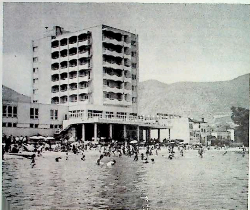
Hotel at Pogradec on Lake Ohër

This is a very popular resort in summer, being much cooler than the coast. Enver Hoxha passed many holidays here. Trade unions run subsidised holiday hotels here for their members, as they do throughout Albania. Children usually spend their summer holidays in Pioneer Camps, which are also heavily subsidised and are to be found along the coast and in the mountains.