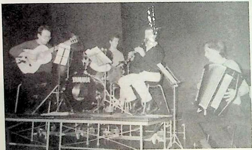
"Liria", playing at the November meeting in London

After hearing the evidence and the arguments for both sides, the audience was asked to function as a jury in the case. It decided without dissent that Britain had violated Albanian sovereignty on 22 October 1946 and on 12-13 November 1946, and that the evidence did not justify holding Albania responsible for the laying of the mines concerned in the case. The request was made for one abstention to be recorded.