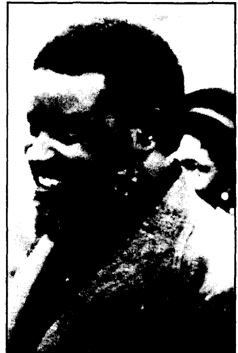
Sam Nujoma of SWAPO

Namibia in 1971 was not just any country — it was de jure the UN's own fief, since, uniquely in international law, after a record number of world court cases, the UN had in 1966 revoked South Africa's old 1922 League of Nations mandate. This had been given to Pretoria by 'His Britannic Majesty' to govern the ex-German colony 'South West Africa' as 'a sacred trust for civilisation'. In fact, South Africa had done