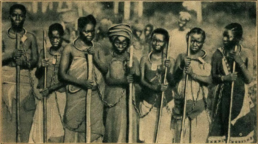
Forced labour in British West Africa.

Aborigines (full or half caste) who take part in politics are subject to the vilest of terror, denied the right to live, and threatened with having their children taken from them, and they themselves with being gaoled for "cattle stealing" or any other charge that may be considered necessary.