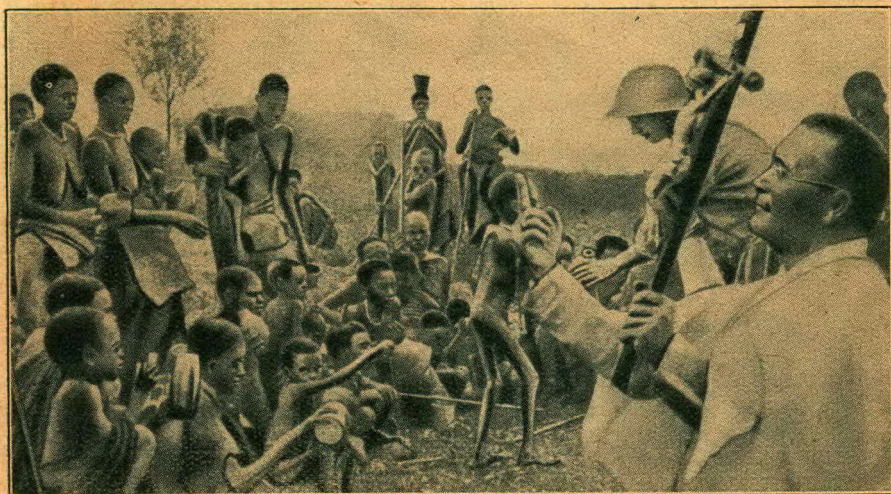
Missionary Recruiting Child Labour in French Congo.

Babies and infants sleep or play on the floor while their mothers work by the matchmaking machines.