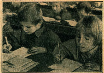
African children on a coffee plantation in Kenya. Children of the plantation owner in School.