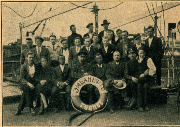
Officers and crew on a Soviet Russian ship in Hamburg.

And in the same way the English Naional Seamen's Union, which is under the leadership of the worst fakers, is carrying on a most shameless propoganda of lies and slanders in its journal, " The Seaman " against the coloured seamen on board of British vessels and in the ports of London, Liverpool, Cardiff, South