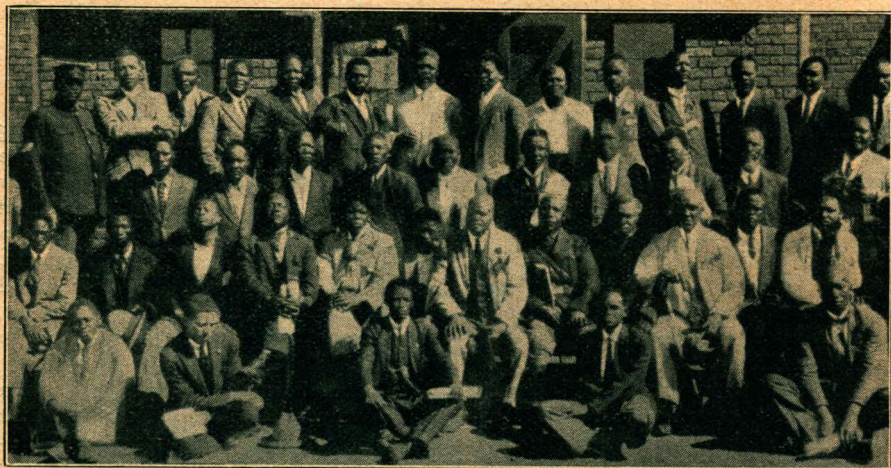
Conference Group of the South Africa National Congress.

Urged on by the ultra-reactionary Afrikaners, Pirow finally decided to raid the native compounds and in the latter part of November wholesale raids were carried out by the armed forces of the state with the aid of gas-masks and tear gas-bombs. Over 600 natives were arrested. These raids had the effect of driving over some of the reformist Native leaders into the militant campaign. Pirow wanted to increase European fears so as to enable his party to railroad through Parliament legislation, depriving the Africans of the freedom of speech, assembly and of the right to organize. In this he succeeded.