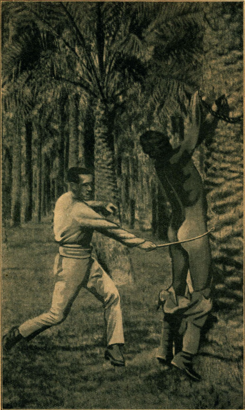
One Example of French "civilization": Flogging a strike leader in Dakar.