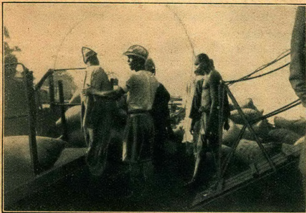
Negro stevedores in a West Indian port. Their wages are 40 cents per day of 10 hours.

Negro seamen and dockers! Only the revolutionary I.S.H. and its affiliated sections like the Marine Workers Industrial Union in America , the Seamen's Minority Movement in England , the C. G. T. U. in France , the African Federation of Trade Unions in South Africa , and the International Seamen's Clubs , which are supporting the program of the INTERNATIONAL TRADE UNION COMMITTEE OF NEGRO WORKERS admit the coloured water transport workers and dockers into their ranks on the basis of complete economic, social and political equality. It is for that reason that we are urging upon all Negro and coloured seamen and harbour workers to join the revolutionary trade union movement as well as the