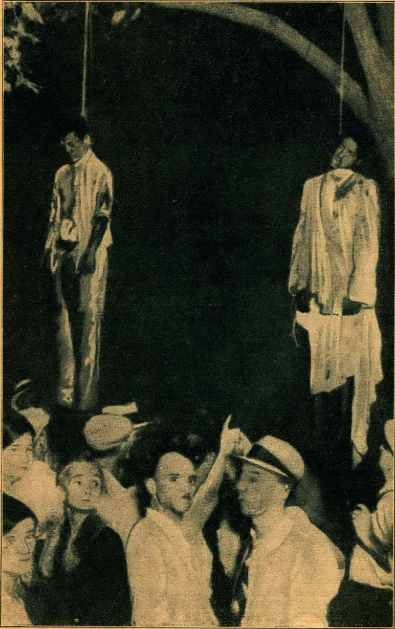
"Democracy" for Negroes in America.