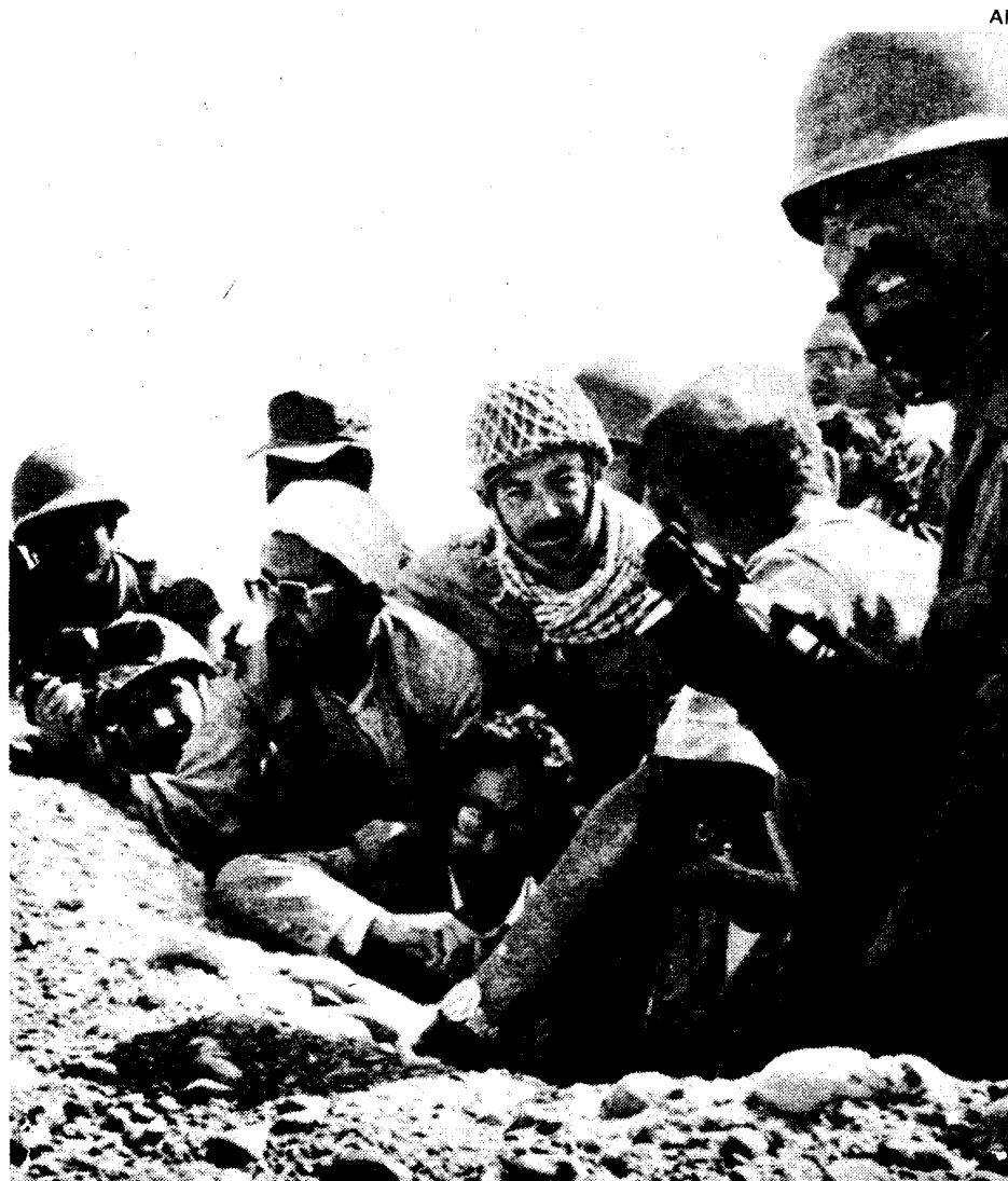
Bani Sadr posing with Iranian troops.

For the Kurds, Hussein's and Khomeini's war is a contest between their genocidal oppressors. But if the contending states are sufficiently weakened or preoccupied with their war on the Gulf, the Kurdish people may have their best chance in decades to win the