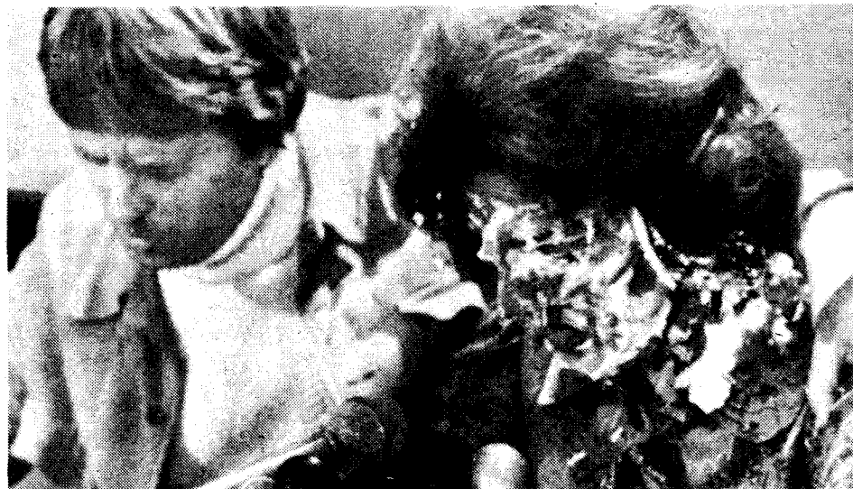
What's on Anita Bryant's face?

August was a bad month for Orange Juice Queen Anita Bryant. The Florida Citrus Commission announced that it will not renew Bryant's $100,000 a year advertising contract. What's more, this former Miss America/born again Christian divorced her husband Bob Green (her "business manager" and an ex-football player whose sexual prowess she had publicly extolled).