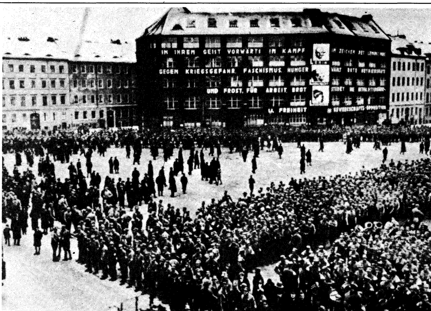
Nazis march on German Communist Party headquarters, January 1, 1933.

"The UF can only be a reality during periods of social struggle, when the need for sharp class battles makes class unity a burning objective necessity that shakes the ranks of the non-communist workers organizations from their lethargy and day-to-day humdrum organizational parochialism, and places strongly before them the need for class