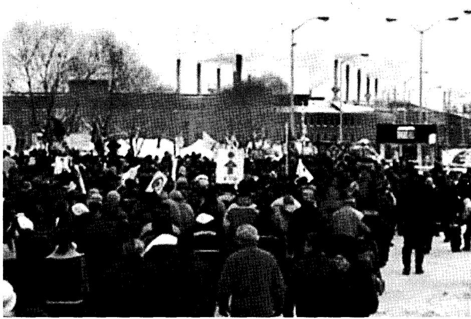
Jonquière, Canada: Mass demonstration in support of militant occupation of Alcan's Arvida smelter, January.