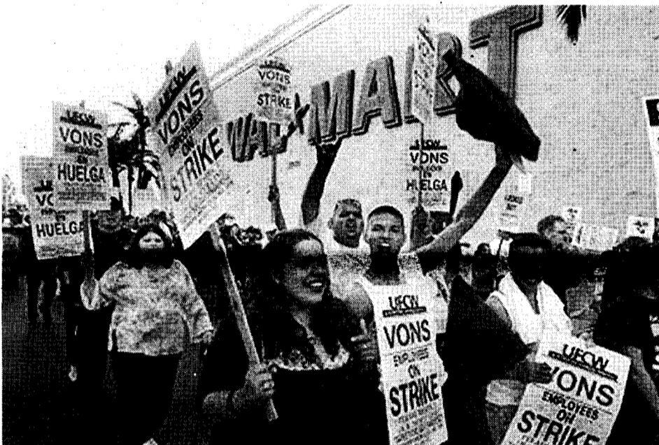
Peters/UFCW Local 1546

Wal-Mart's success is a reflection of the grim state of affairs for unionized workers in North America. In the U.S. today, the unionization rate is just 13 percent. In Canada, it is much higher at 30.5 percent. But this is deceptive: in the private sector, the rate has plummeted in just a generation from 26 percent in 1977 to just 18 percent today. Behind this number is the story of relentless attacks on workers, unions and livelihoods, compounded by a labour leadership that has pushed concessions and givebacks down the workers' throats.