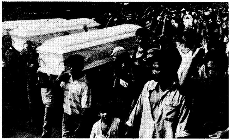
Martyred workers borne in funeral procession by striking sugar workers and relatives in Luzon, Philippines.

The multiple acts of coldblooded murder by the Philippine National Police and units of the Philippine Armed Forces who fired on thousands of striking CATLU and ULWU workers and their supporters with tear gas and high-powered rifles, repeatedly charged the strikers' barricade with armed personnel carriers and waded