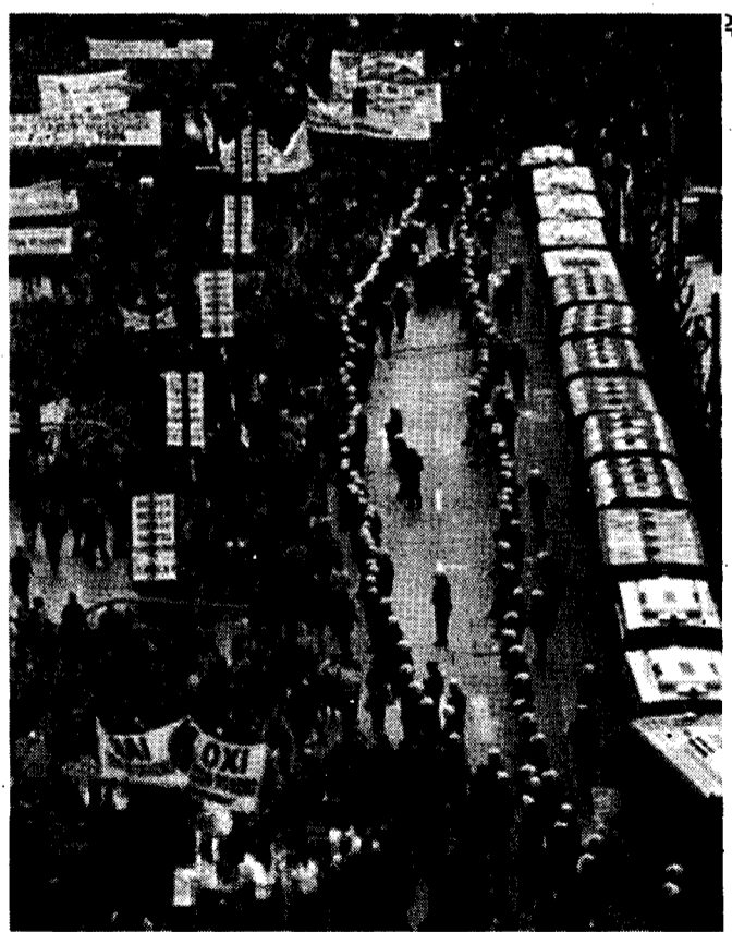
More than 200,000 rally outside heavily guarded U.S. embassy in Athens during four-hour nationwide strike against U.S.-led invasion of Iraq, March 2003.

2. Comrades of the Greek group came to the politics of the ICL through fights and subsequent splits centered on the Russian question. Two members had split from the [ex-Morenoite] Communist League/Workers Power group over the defense of the Chinese deformed workers state, while another comrade of the original group wrote a document supporting the intervention of the ICL into the DDR in 1989-90. Another comrade of the current group came from the Greek Communist Party. Given the influence that the CP has in the Greek working class, it is the main obstacle, so it is very important for the future of the group that an ex-member of the CP is one of the Greek comrades. The group stands for the unconditional military defense of the deformed workers states—China, North Korea, Vietnam and Cuba—and for proletarian political revolution against the bureaucracy. We came to agree with the ICL's analysis of the collapse of Stalinism in East Europe through studying the "Documents and Discussion on the Collapse of Stalinism" by Seymour and St. John in Spartacist