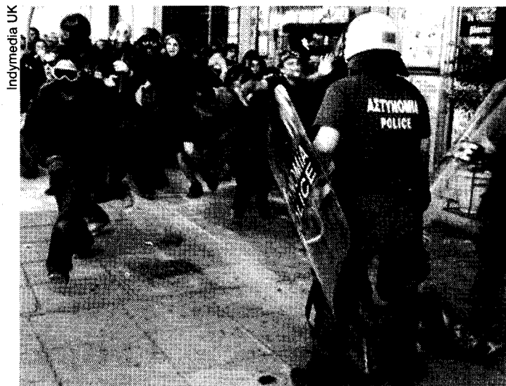
Thessaloniki, June 2003: Police rampage against leftist protesters outside European Union meeting.

in the infamous colonels' dictatorship of 1967-74. Despite this history, the goal of the KKE has remained to find its way back into the corridors of capitalist power."