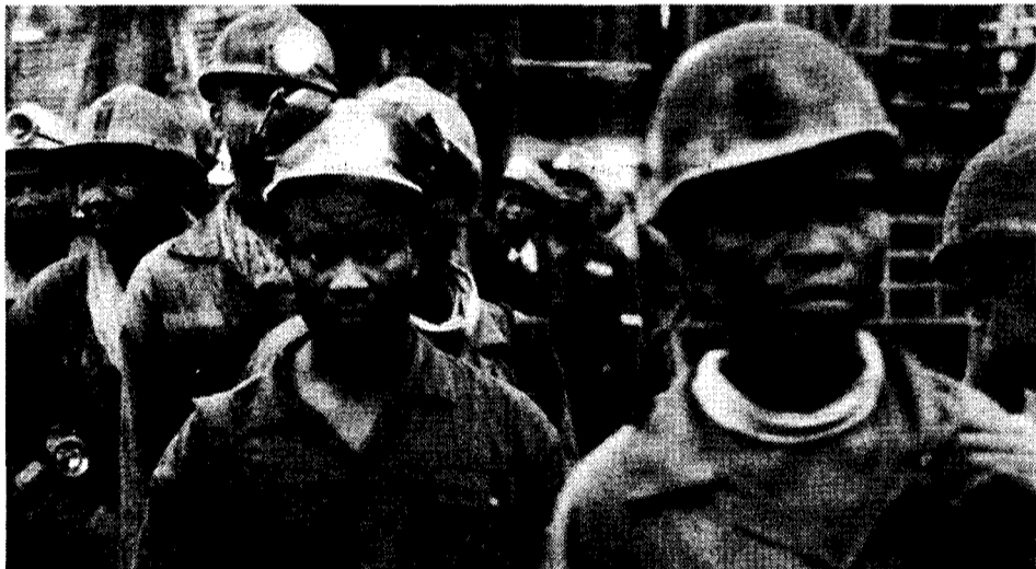
Powerful black proletariat creates the wealth of South Africa.