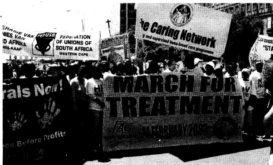
Treatment Action Campaign An estimated 5.3 million people in South Africa are infected with HIV. Above: Treatment Action Campaign march on Parliament in Cape Town demands life-saving drugs from ANC government to fight AIDS, February 2003.

union bureaucrats and the South African Communist Party (SACP) are the foremost obstacles to working-class struggle in this country, and play a key role in the government, administering capitalist austerity. This drives home the urgent need for a class-struggle leadership in the unions to break the working class from the Tripartite Alliance.