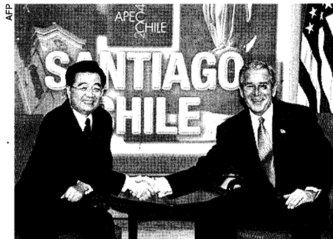
Chinese president Hu Jintao and George W. Bush at APEC conference in Chile, November.

The fact that China is not a planned economy does not vitiate its character as a deformed workers state. There are many examples of Stalinist regimes which have presided over "market socialist" economies. Moreover, the Soviet Union did not have a centralized planned economy during the NEP period. As the "Market Socialism" in Eastern Europe pamphlet states: "The drift toward 'market socialism' is neither linear nor irreversible.... These measures do not amount to creeping capitalism, as many Western bourgeois