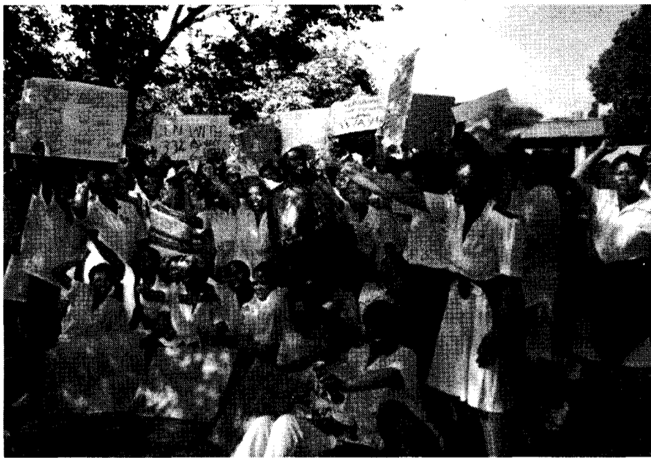
Nurses during 1995 wildcat strike carried signs reading "Away with Mandela," denounced ANC leader as "driver of gravy train" for aspiring black capitalists. ANC government fired 6,000 nurses after strike.

The oppression of women and children is bound up with the role of the bourgeois monogamous family under capitalism, where women are treated as property of men, slated to raise the next generation of wage slaves. The oppression of women may take an even more extreme form in the traditional African family, especially when polygamy is still sanctioned. The