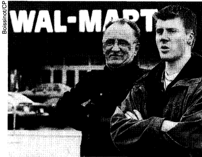
Right: Wal-Mart workers in Jonquière, Canada won union recognition in August. This victory should be catalyst for union organizing drive against Wal-Mart in U.S. Below: UFCW strikers march outside Wal-Mart store in California, October 2003.

For a Fighting Labor Movement! Organize the Unorganized!