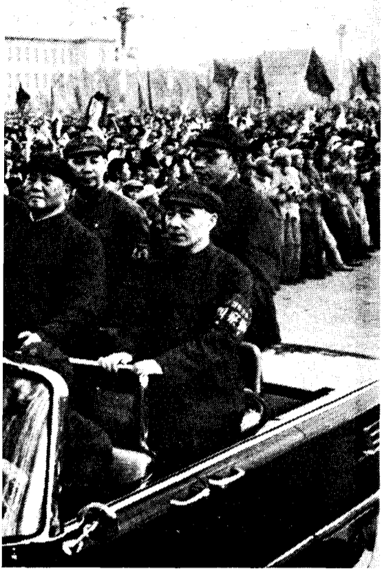
s during 1967 rally in Peking.

the officialdom be allowed to "reform" itself.