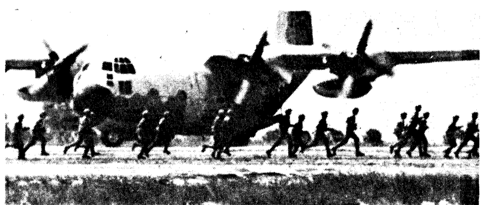
Israeli commandos training for Uganda raid.

Israeli familiarity with the set-up at Entebbe airport facilitated the commando raid. Israel had previously trained Amin's air force and army and had begun the construction of the airport. Amin was himself given paratroop training in Israel, and at least until last week continued to wear the Israeli