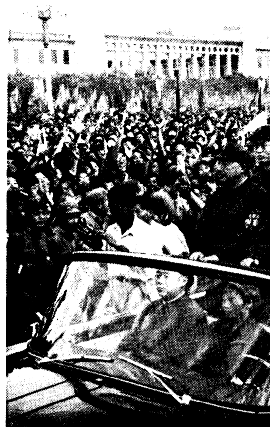
Mao and Lin Biao pass cheering Red Guards

stand up to him as well as their most loyal followers. To achieve such a massive shaking out, Mao turned to two very different forces: the People's Liberation Army (PLA) officer corps and the student youth.