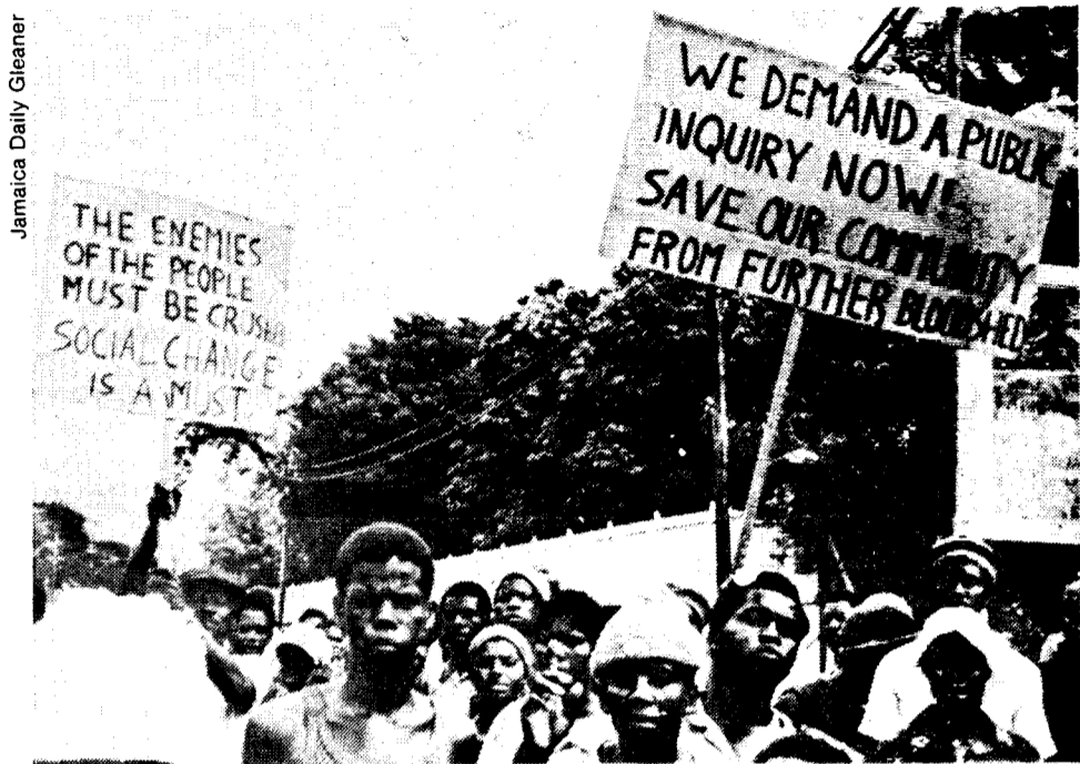
Jamaican demonstration calls for an end to political gang violence, rising inflation and unemployment.

ing to Washington is Manley's growing sympathies for Cuba.