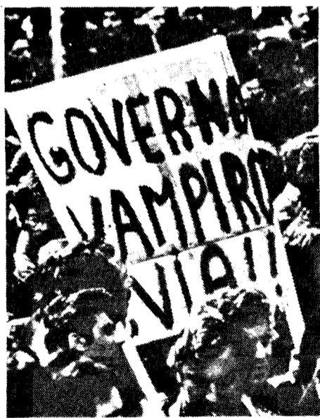
"Vampire government, get out!"

But beyond the prospect of continued parliamentary crisis, the real losers in the scramble for ministerial portfolios