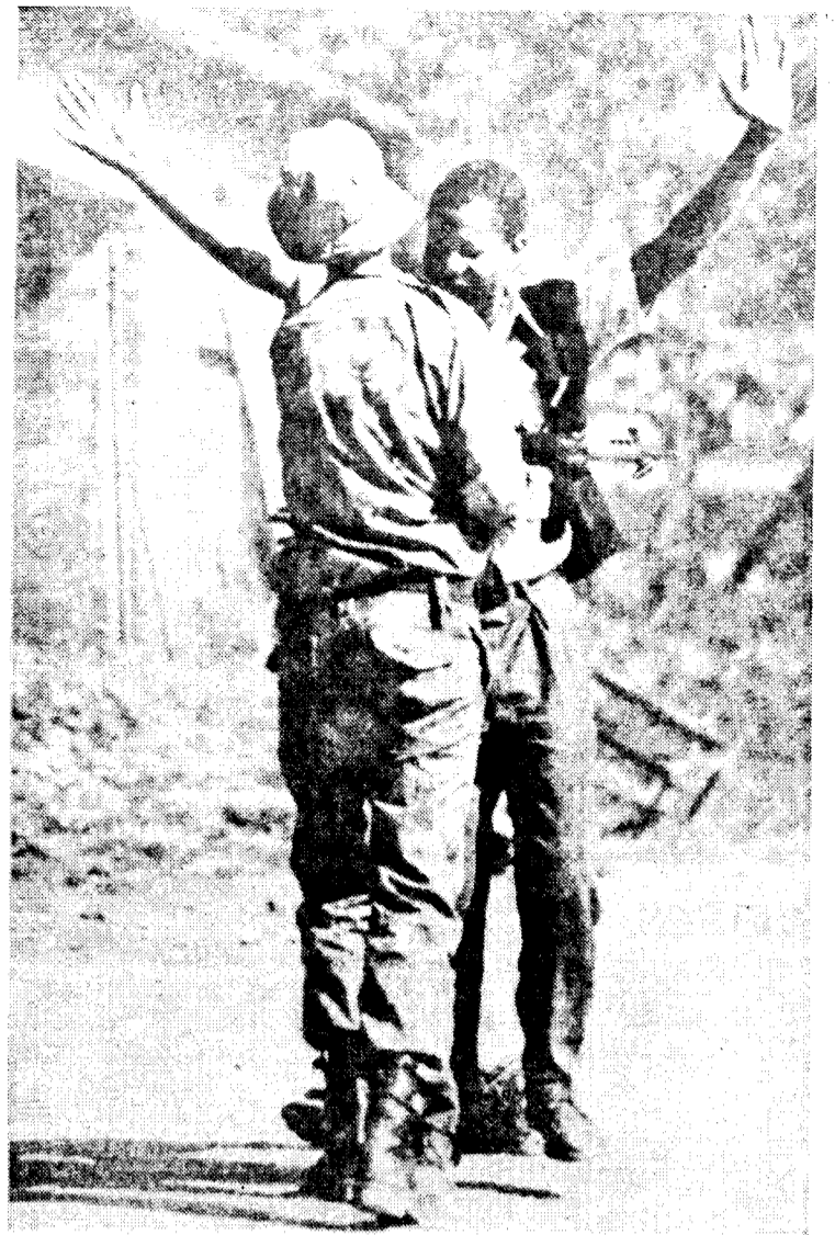
South African policeman searching black worker in Alexandra.

The Transvaal construction industry is an illustrative example. The 1951 Bantu Building Workers' Act permits blacks to be trained in construction trades but to work only in black areas and at a fraction of white workers' wages. During the early 1970's, the Pretoria-based Building Workers Union, affiliated with the all-white Confederation of Labour and headed by right-wing Nationalist Party stalwart Gert Beetze, had to police building sites in the