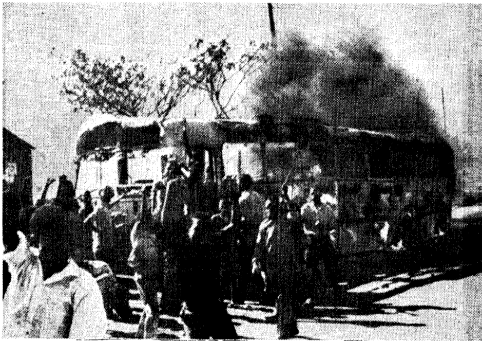
Bus burns during black revolt in Soweto last month.

The organizational aid lent by the Natal Garment Workers Union to the black unions (although later withdrawn under intense pressure from the government and TUCSA leadership), along with numerous other instances of solidarity between Indian workers in