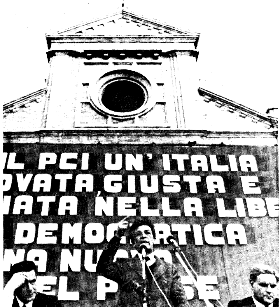
PCI leader Enrico Berlinguer campaigning for "historic compromise" with Christian Democracy.

In both Italy and France the absence of an entrenched social democracy has passed to the Communists the task of disciplining the working class for the bourgeoisie. With the Christian Democrats clearly incapable of dealing with massive inflation and unemployment, there is an opening for the PCI to act even more directly as the watchdog of