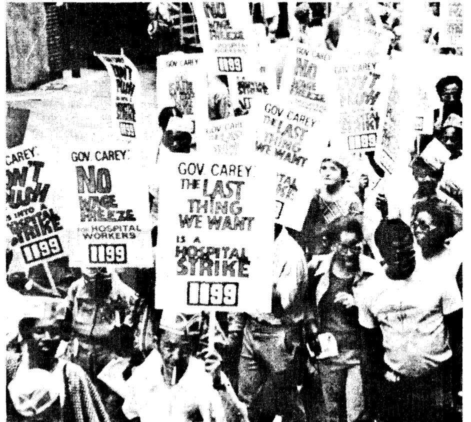
Hospital workers called for binding arbitration at pre-strike demonstration in front of Governor Carey's office last week.

But the militant strikers continued to turn away workers and patients whom they did not consider to constitute