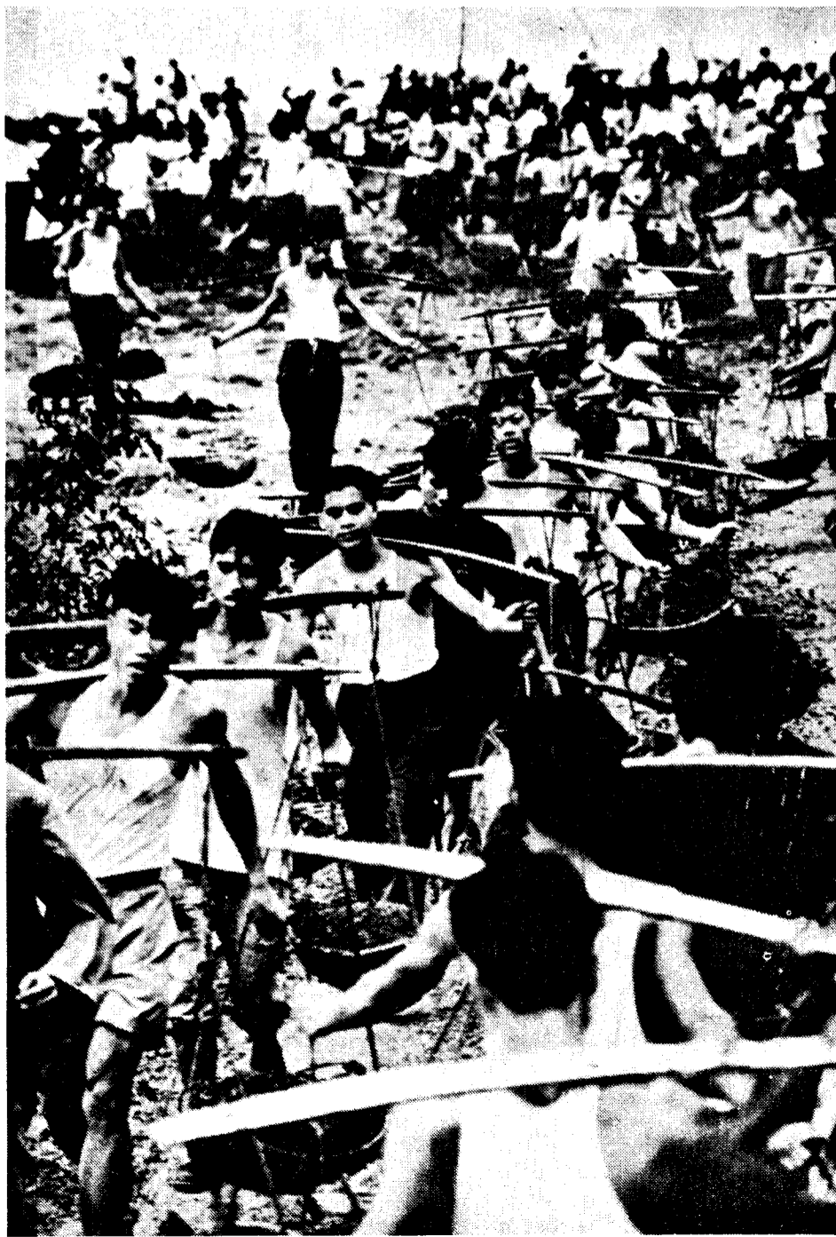
Commune peasants building dam.

A key element in Mao's launching of the "Cultural Revolution" was to lay the political basis for another economic Great Leap Forward. This required a purge of those leaders strong enough to