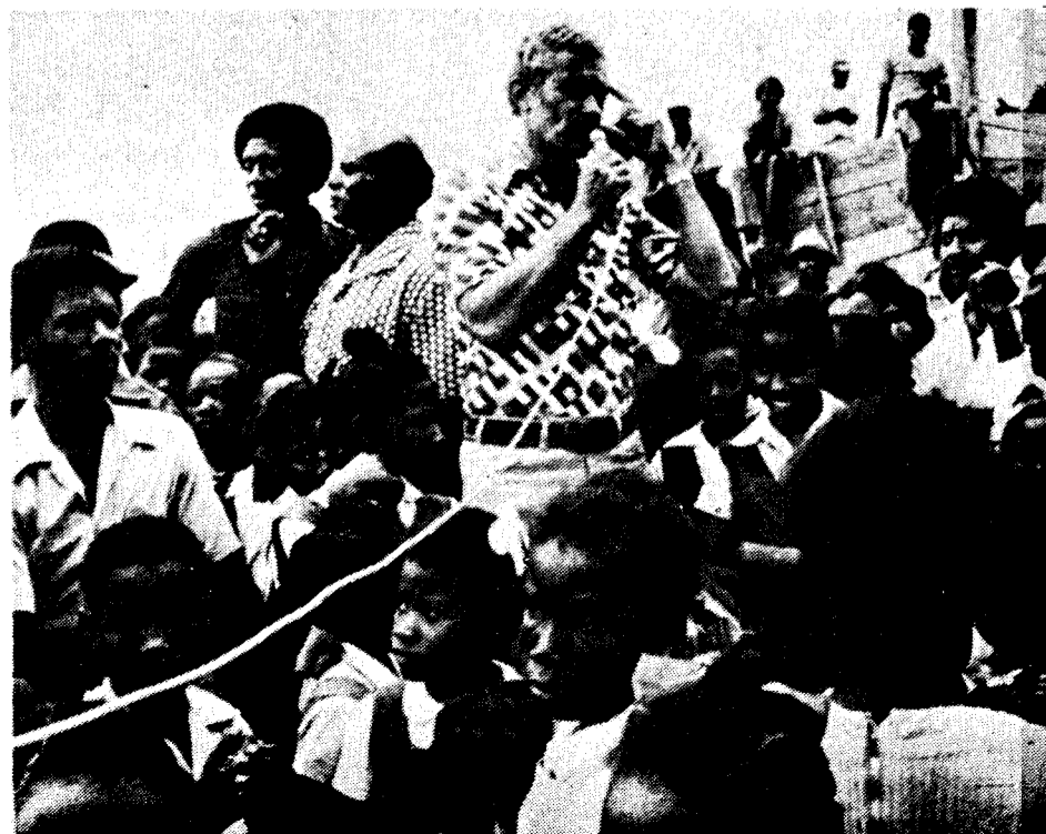
Prime Minister Michael Manley speaking at rally.

Sharpened political hostilities on the island coincide with and are undoubtedly nourished by growing hostility in imperialist circles toward the Manley regime. The U.S. bourgeoisie was obviously displeased by the three-fold increase in bauxite excise taxes in 1974, and the Jamaican government's announcement last year of its intention to assume 51 percent interest (with compensation) in American-owned mining properties. Equally if not more disturb-