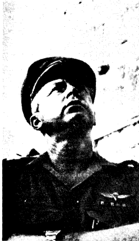
Israeli premier Yitzhak Rabin

According to the London Observer , a 75-year-old hostage was dragged