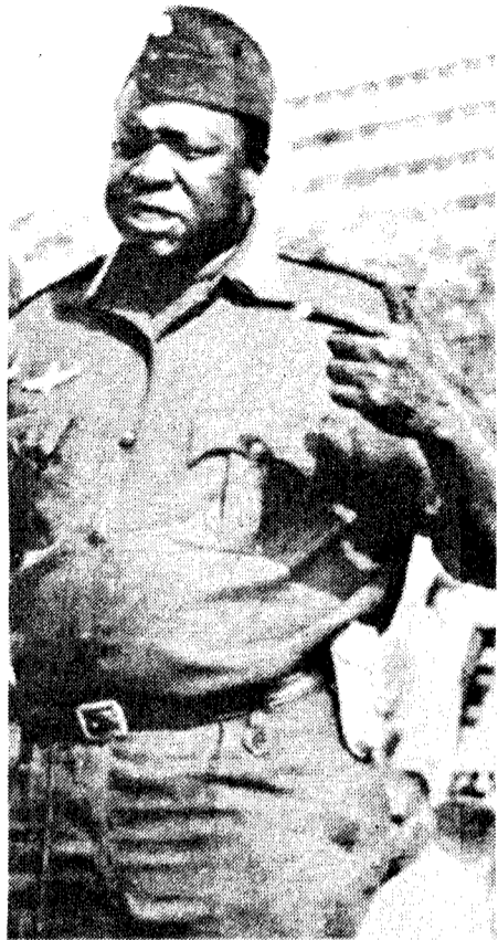
Ugandan president Idi Amin

We defend those acts of an oppressed people which are aimed against the actual agents and manifestations of their oppression, but not acts of indiscriminate terror which fail to draw a class line within the oppressor nation. Thus we call for freeing all the Palestinian and pro-Palestinian prisoners whose actions, no matter how ill-advised, actually strike against real manifestations of national oppression, including those still imprisoned in Israel for the West Bank-Galilee demonstrations and