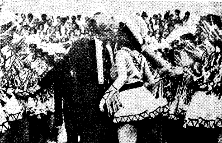
Ford can kiss and shake hands at the same time.