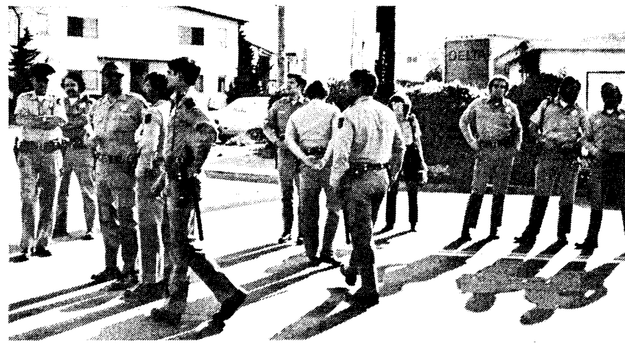
Berkeley cops escorting scabs at Victor strike last month.