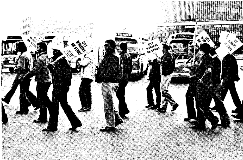
Pickets block buses at East Bay Terminal.