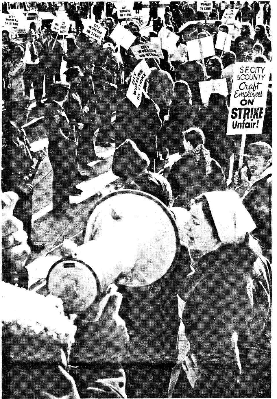
City workers picket City Hall, April 14.