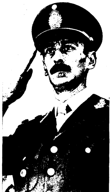
General Rafael Videla

The Argentine Frente Justicialista [Frejuli, the official Peronist party] is a bourgeois populist party, created by the bourgeoisie itself in order to dominate the rising workers movement in the 1940's. This is how the present CGT arose as a trade-union organization built and supported by the bourgeoisie in order to destroy proletarian militancy. When General Perón proved incapable of fulfilling his class function, he was violently removed and obliged to take an extended vacation in Spain. However, the military governments which followed Perón's fall were also unable to attain social peace. Thus the bourgeoisie was forced to recall the exile