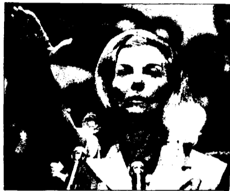
Isabel Perón saluting