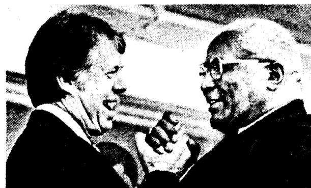
Jimmy Carter with Martin Luther King, Sr.

Ominously, while Carter was issuing phony apologies for his "choice of words" (talking about how much he approved of "low-status neighborhoods"), Gerald Ford seized the opportunity to proclaim that he was as much for preserving "ethnic heritage" as the next Aryan candidate. Clearly Ford did not view Carter's remarks as a "slip" so much as a challenge, a bid for the backlash vote just as Wallace is pulling out of the race. Even the liberals' darling, Morris Udall, while