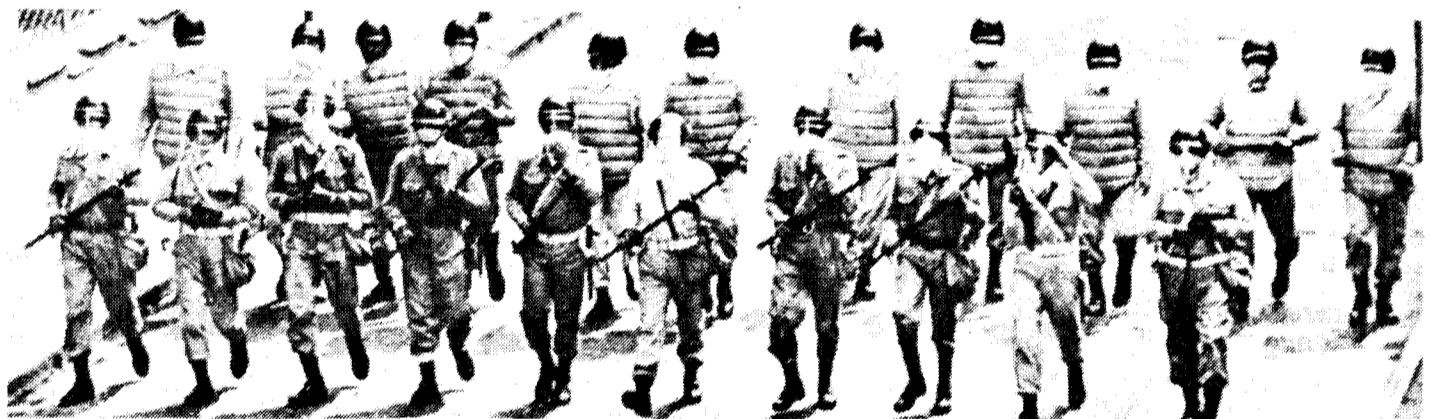
U.S.-trained Argentine riot police

Argentine working class and likewise against its class brothers from other parts of Latin America who have been forced to emigrate to Argentina, whether for political or economic reasons (assuming that one could speak of pure politics or economics). In particular, hundreds of thousands of workers and peasants have crossed the Andean cordillera from Chile; the brutal repression against them has already begun. By common agreement, the representatives of capital open their borders in order to communicate in the language of death and destruction of the proletariat. Before March Perón had already handed over hundreds of Chileans to the Chilean bourgeoisie; now this deadly traffic in human beings is increasing.