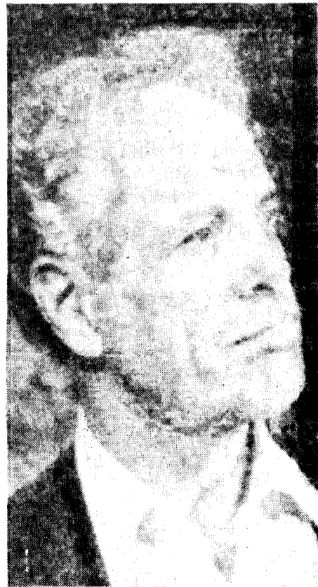
Beacon Journal (Akron)

As soon as the midnight, April 20, deadline passed, Akron workers