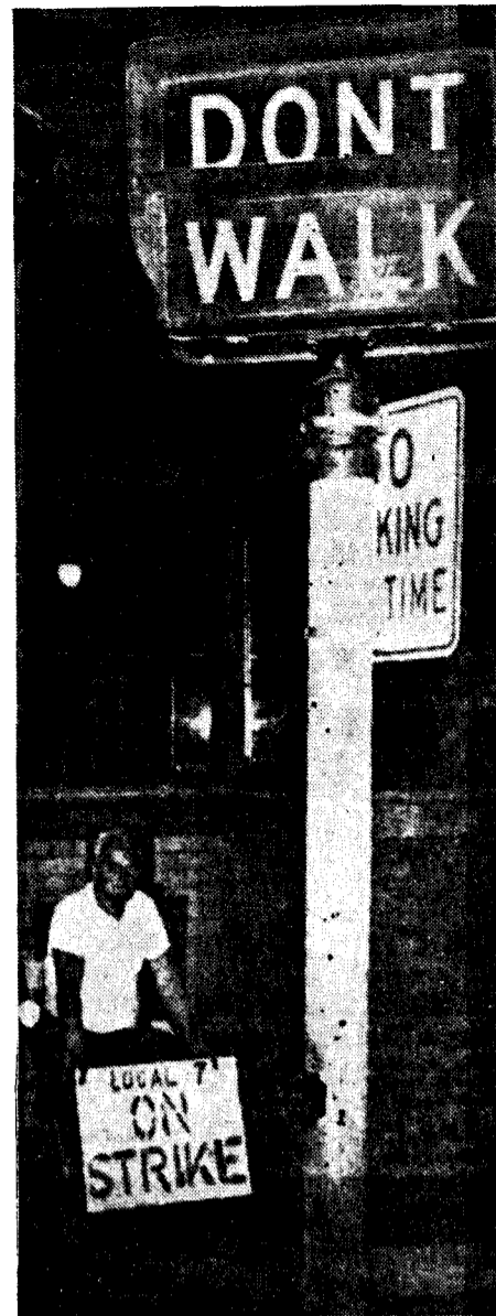
Ott Ganji/Beacon Journal (Akron)

The international implications of the strike cannot be ignored even by narrow business unionists like Bommarito.