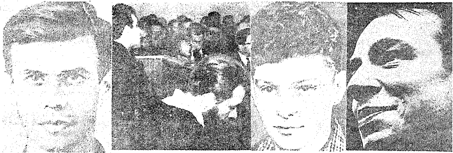
Left to right: Yuri Galanskov; Daniel & Sinyavsky; Alexander Ginsberg; Voznesensky.