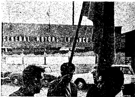
FREMONT - (FRANCE)

The Renault factory is nationalized. Nationalization without WORKERS CONTROL is not a full solution!