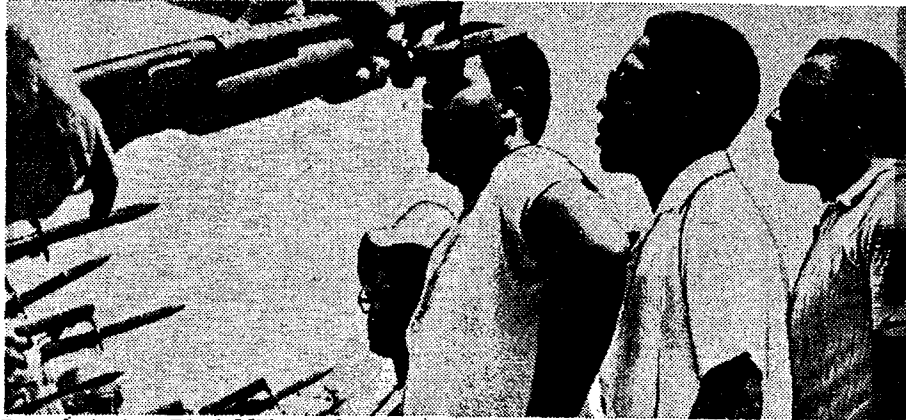
Today's Action: Black Militants face bayonets. All workers have a stake in the outcome.