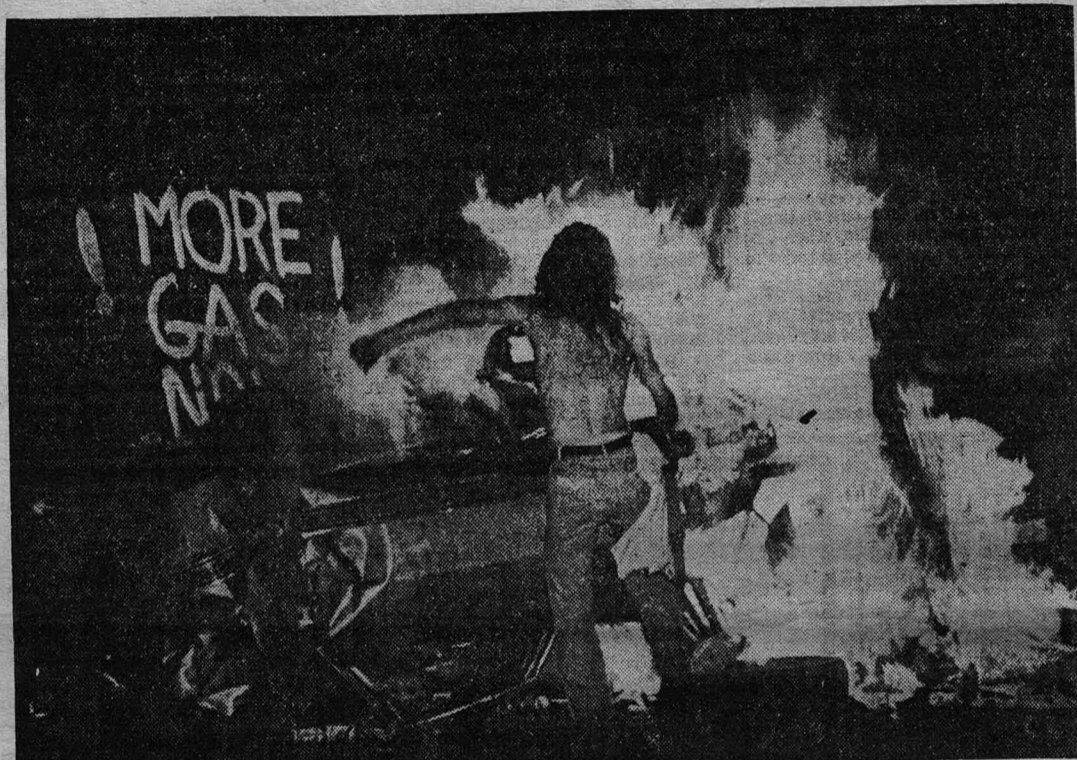
200 people arrested during "gas" riot in Levittown, Pa.

To convince the youth and the masses of workers that they have no place in this "democracy," that this "democracy" is the source of confusion and demoralization. And that their road is the road of the revolution and its preparation.