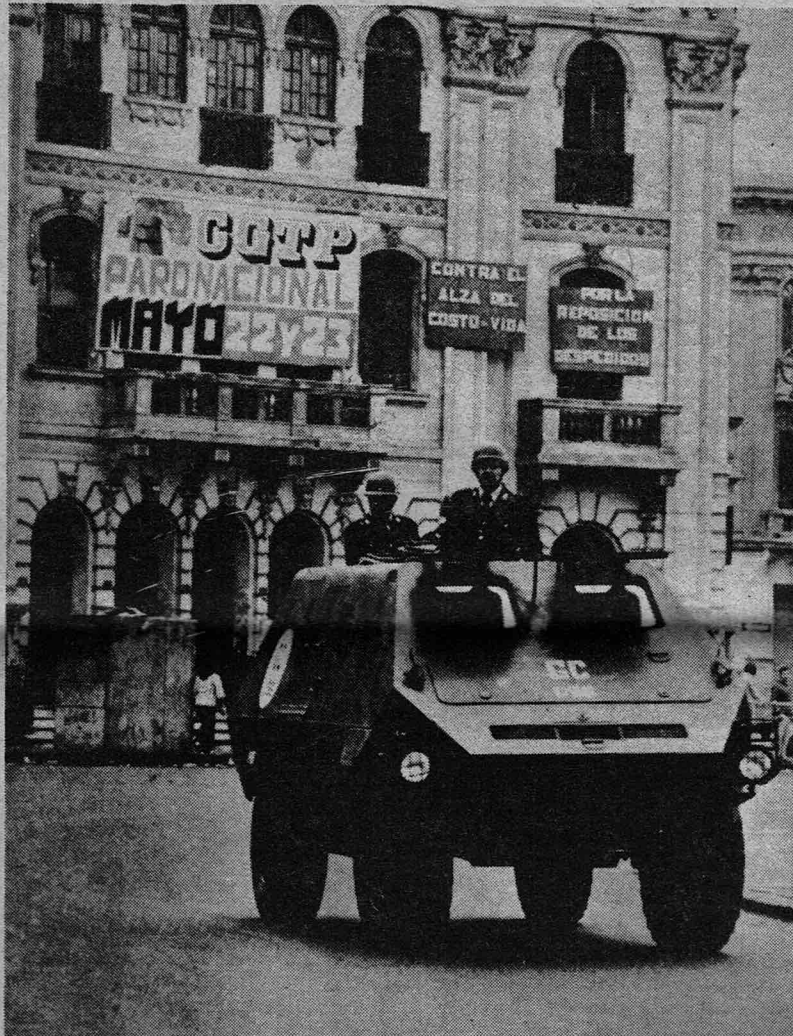
TROOPS PATROL TRADE UNION HEADQUARTERS IN LIMA, PERU DURING THE RECENT GENERAL STRIKE

So for the SWP to call for true "human rights" only gives Carter and his bourgeois campaign credit that it doesn't deserve. Carter has no intention of fighting for rights. His campaign is a cover for GROWING imperialist intervention in the affairs of Latin America. Recently, the Carter regime commended the Chilean regime of Pinochet for its step toward "resolving the human rights problem" in Chile. In fact, the amnesty which Carter liked so much, also dropped all charges against the military for any crimes they might have committed since the 1973 coup, and has declared that proceedings filed by the families