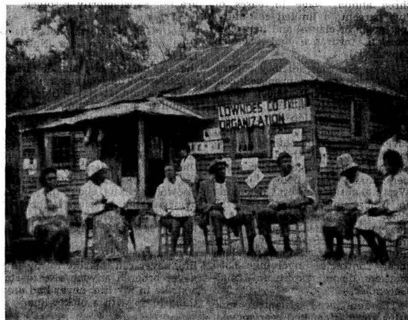
READY TO VOTE. Lowndes County residents wait in front of Freedom Organization headquarters to be driven to polls.

NEW YORK — As we went to press the New York Board of Elections was slated to make available the elections returns for New York City, including the gubernatorial vote of the Socialist Workers Party. If the canvass is made as scheduled, we will report the vote in our next issue. Complete state returns will not be available for several more weeks.