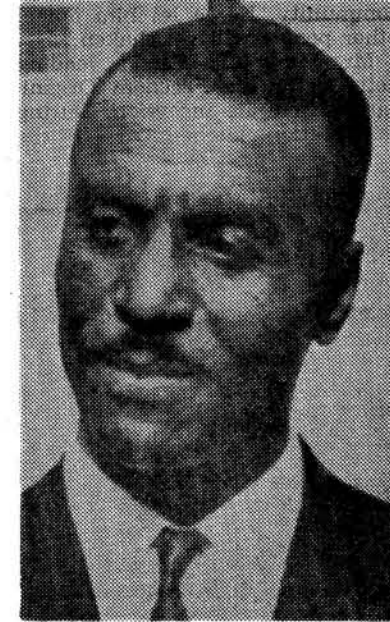
Rev. Fred Shuttlesworth

SCEF also made plans to help organize Southwide opposition to plans of the House Un-American Activities Committee (HUAC) to "investigate the civil-rights movement on the pretext of looking for 'subversive' influences in outbreaks which occurred in various cities."