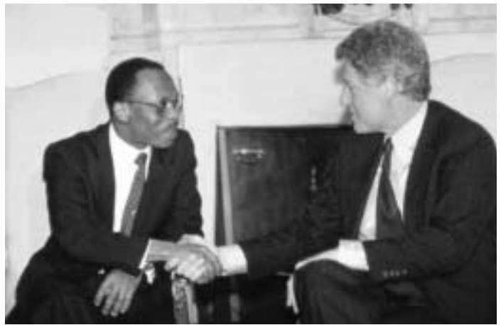
Aristide and Clinton shake on deal that returned Aristide to power in return for imposing pro-imperialist austerity on masses. Aristide made good on his promise, but not enough to maintain imperialist support.

Though Aristide's reforms were too much for the Haitian and imperialist bourgeoisies, they were too little for the masses, who sank ever deeper into poverty and hunger. Aristide's cronies and