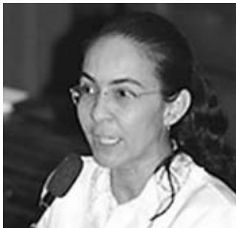
Reformist Senator Heloísa Helena, ousted from PT for voting against pension cuts

ment's pension reform. During the parliamentary votes on the pension bill, their six deputies and two senators split three ways – pro, con and abstaining. Some members voted differently on different readings of the bill. Only one, Senator Heloísa Helena, consistently voted against; she then dared the PT leadership to expel her, which they eventually did. The rest of DS, far from leaving the PT, voted unanimously at their national congress of November 21-22, 2003 to stay in, and hailed its minister Rossetto as a hero.