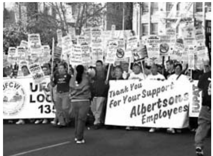
California supermarket strikers on the march. Class-wide workers' action, not electing Democrats, is the only way to stop capitalist attacks.

At the outset, the overwhelming majority of the ruling class approved the Iraq war: it was an assertion of U.S. dominance over its imperialist rivals as well as over the super-exploited countries of the "third world." But even then, many bourgeois spokesmen