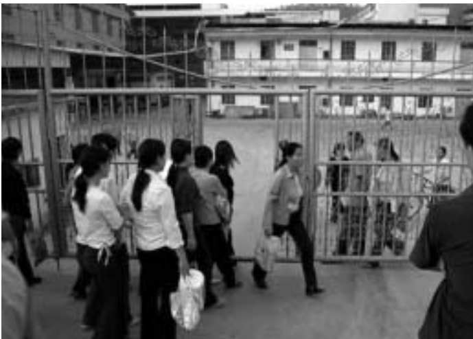
Night-shift workers at guarded factory gate in Shenzhen.

Capital has relied on the fact that most workers in the SEZ's, often coming from desperate circumstances, will actually see their toil in the sweatshops as a step up from their previous existence. Many do, as they continue to pour in from the countryside. This is an unquestionably conservative influence. But the