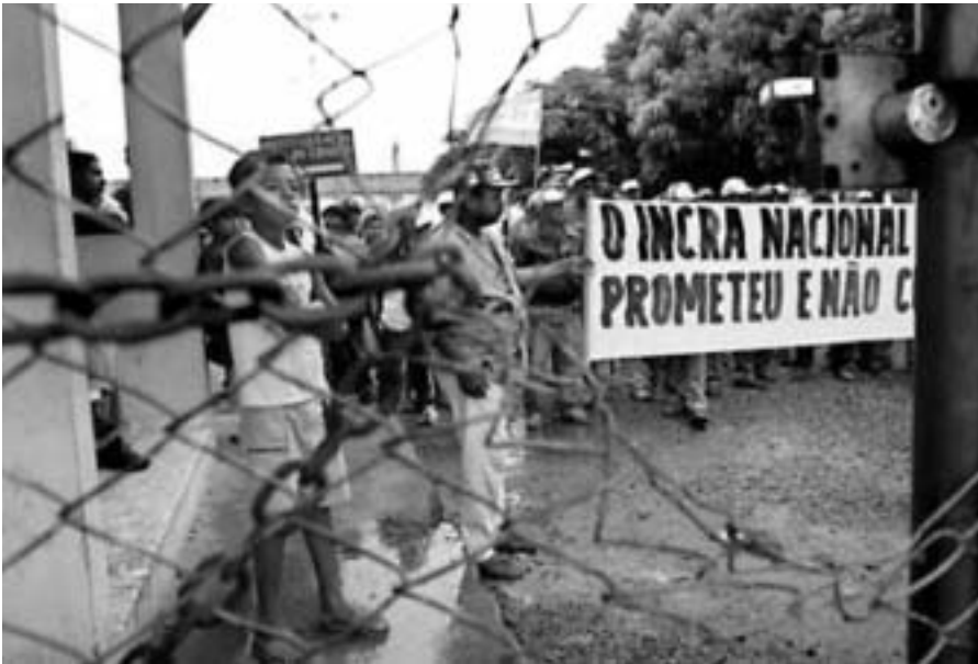
Farmers stand inside the National Institute for Agrarian Reform (INCRA) in Brasilia, Jan. 20, 2004. About 600 farmers invaded the institute to demand land for 6,800 families, a promise broken by the government. The complete sign at right reads 'INCRA promised but didn't fulfill.'

demand that the MST leaders support them. In fact, such a demand should be fought for throughout the workers' movement in preparation for attacks on strikes and other struggles.