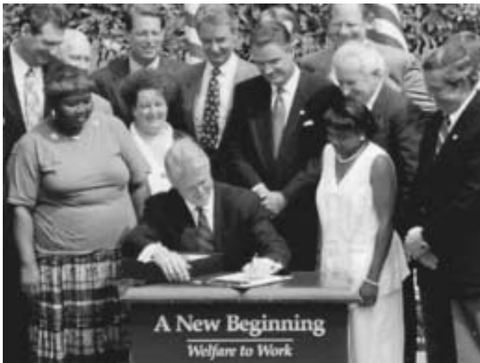
Clinton’s welfare “reform” launched slave-labor “workfare” program

The process by which the moderate-conservative bourgeoisie has achieved success in detouring anger is vital for working-class activists, above all revolutionaries, to understand. One benchmark: a year ago, there were massive protests in the United States, along with the rest of the world, against the Iraq war. This