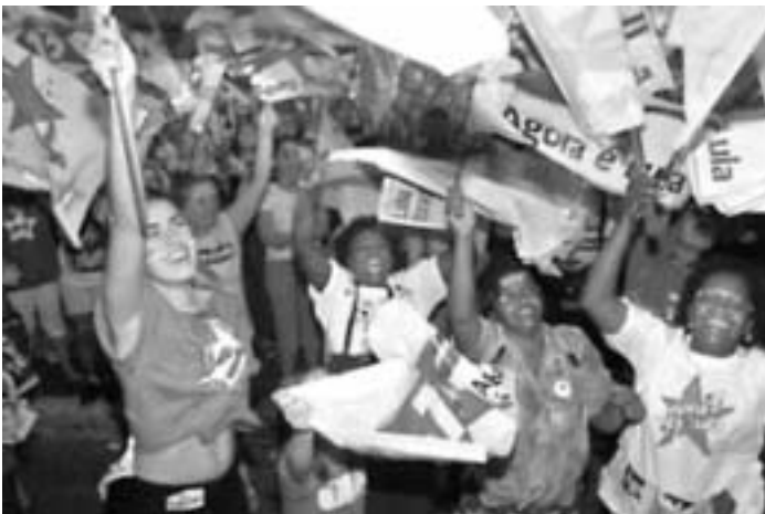
Lula supporters celebrate PT election victory, October 27, 2002

Through a series of electoral campaigns, the PT leadership signaled the ruling class and imperialists that it would not challenge the system. But pressure from the ranks continued to force the leadership to promise radical reforms that the capitalists could not tolerate, like repudiating the country's foreign debt. Until the PT leadership had proven its ability to truly dominate its members and millions of working-class supporters, it would be strongly opposed by the capitalists.