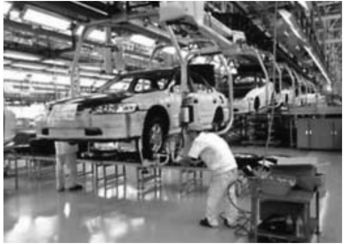
Auto factory in Guangzhou.

Thus, the level of propaganda against party suppression of protest has declined markedly since the Tiananmen massacre: a function not only of a general awareness of the Stalinist role but the realization that the protests are more and more consciously aimed at the reform process the imperialists back. A more specific benchmark of this appreciation is the reaction to the recent SARS crisis. The Chinese authorities initially stonewalled evidence of the disease; but their later efforts using the party machinery to