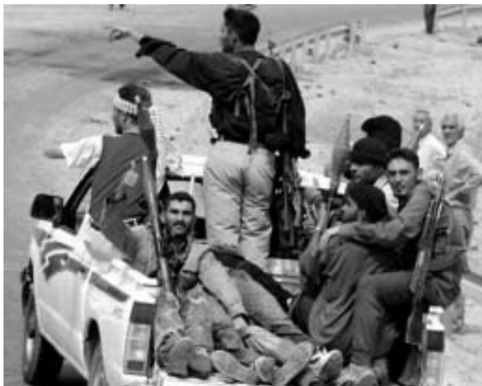
In the midst of popular hatred of the U.S. occupiers, guerrilla activity in Iraq has not ended.

There was a weekend of militant demonstrations in January in Amarah centering on the critical issue of jobs. It was violently