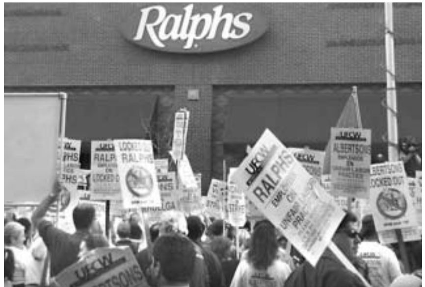
Marching strikers rail at Ralphs, one of the grocery chains that locked out union workers – but union bureaucrats betrayed struggle early on by removing picket lines from Ralphs stores.

While this class-conscious stand has not been enough to turn the tide of this strike, this kind of courageous action will always be key to overcoming the bosses’ attacks and the bureaucrats’