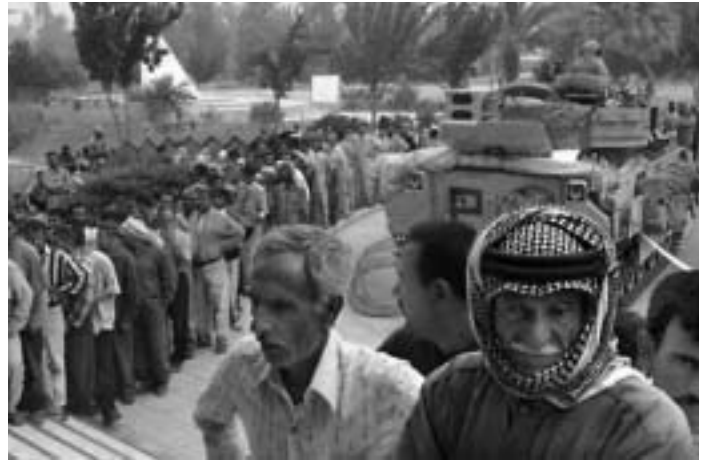
Iraqi workers in payroll line at phosphate plant in Al Qaim.

Some of these goals began to be achieved with the success of the invasion. But the American military and political machine did not count on the sheer volume of the military destruction it had wrought, the breakdown of Iraqi society or the success of the eco-