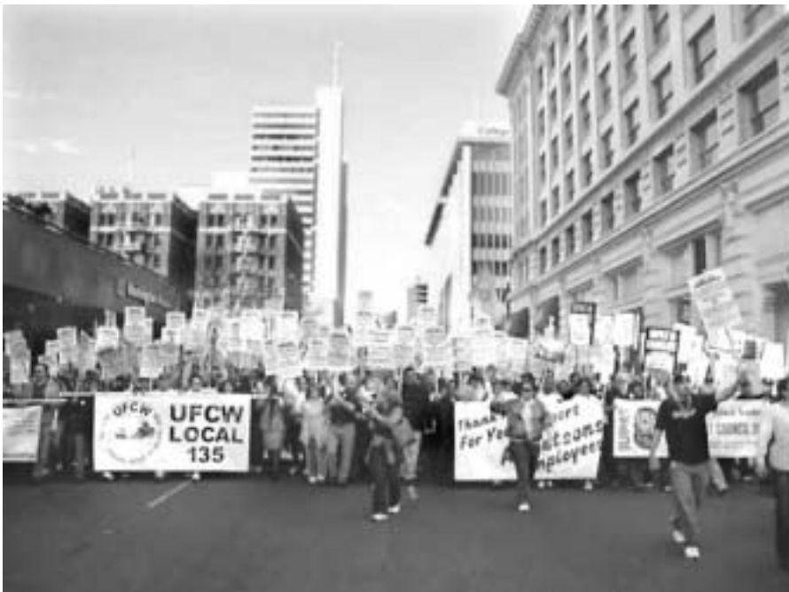
Supermarket workers march to stop wage and health-care cuts.

It is necessary to uncover the real reasons behind the bureaucrats’ betrayals in order to combat them effectively. In the wake of an impending disaster like the one in California, there are two different superficial conclusions that people often come to: either the leaders just made a lot of mistakes by accident or incompetence, or