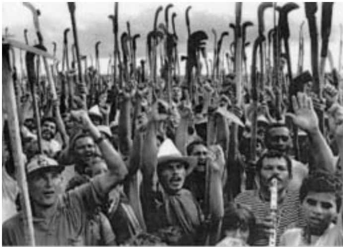
Landless workers of MST rally against capitalist landowners in 1997.

Lula saw his opportunity and launched a new campaign to win bourgeois support. The PT leadership offered to use its