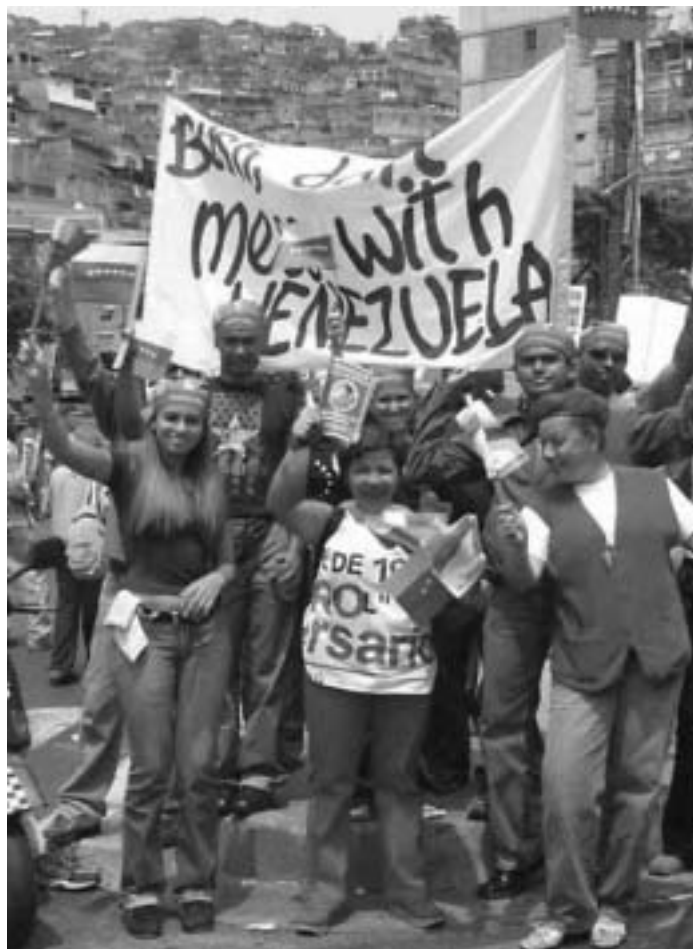
“Bush, Don’t Mess with Venezuela”

Such a party would build support internationally, with an economic and political program geared to leading an international fight against imperialism. In explosive Latin America today, a united struggle of the workers and oppressed is just waiting for the right leadership to emerge.