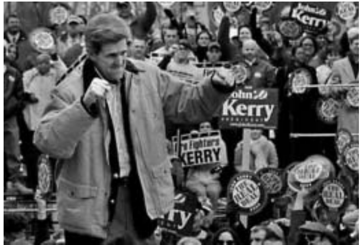
Democratic front-runner John Kerry has same imperialist world-view as Bush, calls for stronger U.S. military in Iraq.

In the current campaign, virtually all the Democratic candidates ended up responding to the growing tide of fury and frustration by pushing populist anti-Bush rhetoric. Howard Dean caught fire with his "outside-the-Beltway" stance condemning his rivals and the Congressional Democrats for caving in to Bush on the war; he became the front-runner for a few months. John