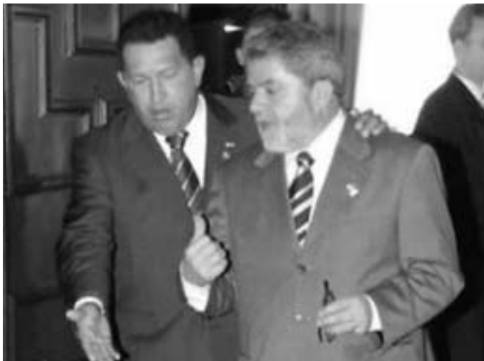
Chavez and friend Lula at the G 15 Summit in Caracas on February 27. In 2002 Chavez backed Lula's presidential campaign, touting him as a "great man". Lula stabbed the working class in the back – but Chavez remains loyal.

Chávez operates on a continuum with other bourgeois and petty-bourgeois nationalist politicians, including most prominently Lula and Cuba’s Castro. Far less moderate than Lula at the moment, Chávez nevertheless is trying to cut a better deal with imperialism, not overthrow it. His relation with the supposedly communist Castro is a key component of Chávez’s image as a