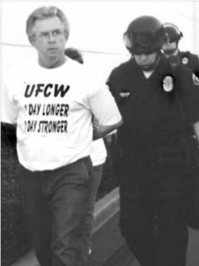
Cops arrest UFCW striker. Police are capitalists' troops in ongoing class war.

The UFCW leadership had foreshadowed these moves a few days in advance when it made its official sell-out “compromise” contract counter-proposal December 19. They offered to accept virtually all of the bosses’ two-tier scheme to slash wages for new hires, asking for only pennies more than what management had demanded. (Where the bosses proposed a starting wage of $8.90 per hour for newly hired food clerks, the union bureaucrats actually responded with a counter-proposal of $8.95! For general merchandise/meat clerks, they held out for a whopping $7.90 where the bosses offered $7.55.) And they made major concessions on health care as well.