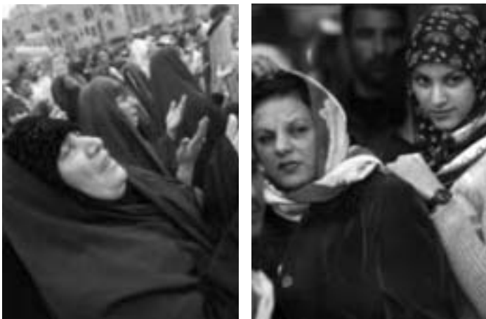
Women's groups in Iraq are struggling for their democratic rights. Revolutionary communists stand for full and equal rights for women.

Therefore popular propaganda and even agitation for immediate gains must also begin now, if revolutionary ideas are to be seen as relevant. Workers come to see revolutionary answers as a result of their victories, not out of their defeats and destruction.