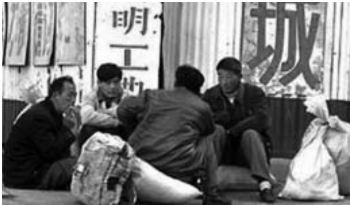
Unemployed workers in Beijing.

The more capital has shifted production to China, the greater the impact has been on the working class internationally. While labor bureaucrats and domestic manufacturers in the imperialist countries have exaggerated the impact of these capital shifts to East Asia for protectionist purposes, the impact is real, particularly in the garment and textile industries in the U.S. where hundreds of thousands have lost jobs and factories have moved or closed. Increasingly, workers in poorer countries in Eastern Europe and Latin America are also seeing their jobs outsourced.