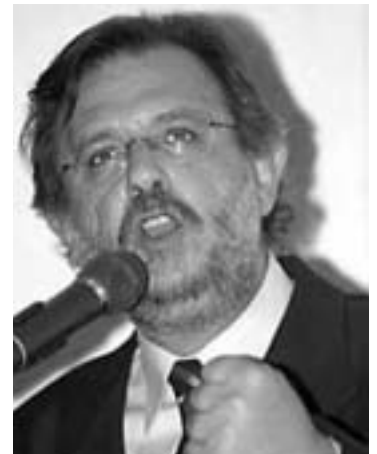
Democracia Socialista leader, Miguel Rossetto

The main test of the DS came with the PT govern-