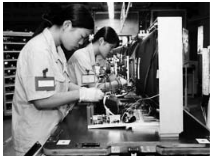
Haier Group factory in China's eastern port city of Qingdao.