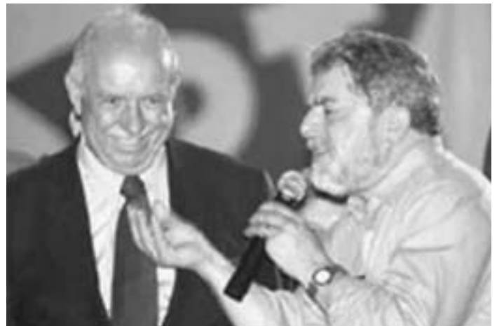
Capitalist Vice President Alencar beams at Lula's betrayals of workers.