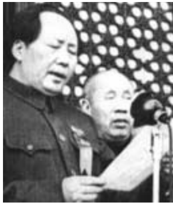
Mao Zedong in Beijing, October 1, 1949, proclaiming the founding of the People’s Republic of China.

Getting rid of the imperialist boot was one of the genuine gains of the Stalinist revolution and its aftermath. There were others, like the seizure of landlords’ holdings for distribution among the peasants, as well as in health, education and women’s rights. Over time urban workers would win rights to jobs. But these were not the achievements of a workers’ revolution; indeed they were allowed only in the absence of a proletarian alternative and as a result were very limited in their democratic and class content.