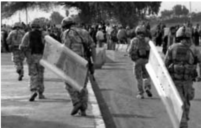
In Amarah, British occupation troops assault militant protesters demanding jobs, January 11, 2004.

malleable to a compromise on direct elections. In one stroke he fosters illusions in the U.N., the imperialist enforcer of the murderous 12-year embargo against Iraq, while sowing the basis for a sellout on the elections issue. Although he continues to hang tough on the issue of elections themselves, he is signaling openness on their timing and the governing arrangement in the interim.