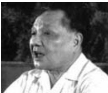
Deng Xiaoping, architect of China's turn to overt capitalism.

The main reforms have had overlapping aspects: allowing foreign capital to develop export industries; opening the internal economy to foreign ownership and control; privatization of much of the statified sector. After a period in which foreign firms had to accept joint ownership with Chinese firms, they have been given far more freedom for their own ventures. With changes introduced by then-President Jiang Zemin in 1997, and the introduction of China into the World Trade Organization in 2001, foreign firms have not only proliferated in the export regions but have entered the Chinese market en masse. Almost 25,000 foreign investment projects were approved in 2002, an enormous number itself and a 33.4 percent increase from the year before. In 2002 alone, $50 billion of foreign investment projects poured in.