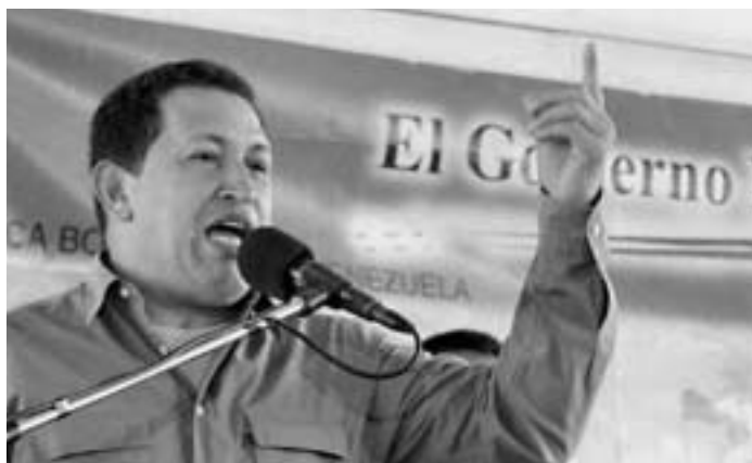
Chávez talks of a “third way,” neither capitalist or communist. In practice he defends capitalism and private property.

Workers’ revolution is not a goal which can be indefinitely postponed. It is the only way to crush what will inevitably be repeated coup attempts if imperialism doesn’t get its pound of flesh. It is the only answer for the Venezuelan working class. In this regard, our most important work in the coming days is to convince other revolutionary-minded workers of the need to build the party of proletarian revolution and engage in every struggle designed to raise workers’ consciousness of what is to be done.