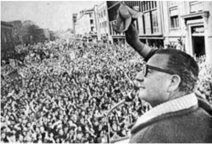
Allende after 1969 electoral win in Chile. Allende, like Chavez, advocated class collaboration as a step toward "socialism." Time and again the masses demanded arms and a decisive strategy against bosses' strikes and coup threats. In 1973 the masses paid the price when the U.S. backed a successful military coup that crushed the movement.

the class uniting to fight for greater equalization of wages and jobs for all. Steadily employed workers can be deemed to be part of the "rich" by poor workers; they can come to see themselves in that false light as well. In this way the unity and power of the working class are divided and inevitably conquered.