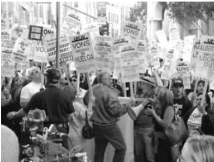
UFCW strikers confront bosses, cops. Labor bureaucracy holds back militancy to accommodate capitalists' profits.

The essential role of the labor bureaucracy in the capitalist system is as brokers for the sale of the workers' labor power to the capitalists. As such, their very existence – and their six-figure salaries – are dependent on the existence of the capitalist profit system itself. Therefore any method of struggle that even points to the question of challenging the capitalist system of exploitation and profit altogether, is repellent to union bureaucrats – they avoid it like the plague. At best, they want to get what they see as a good deal for the workers, but only within the limits of what is “reasonable” so that the capitalists can still make profits.