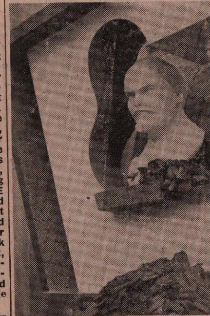
BUST OF LENIN DESECRATED BY LONDON FASCISTS.

The fascists have recognised in Lenin the very personification of all that they hate. And they have crept out in the darkness of night to cover with their filth the statue, not of a defender of