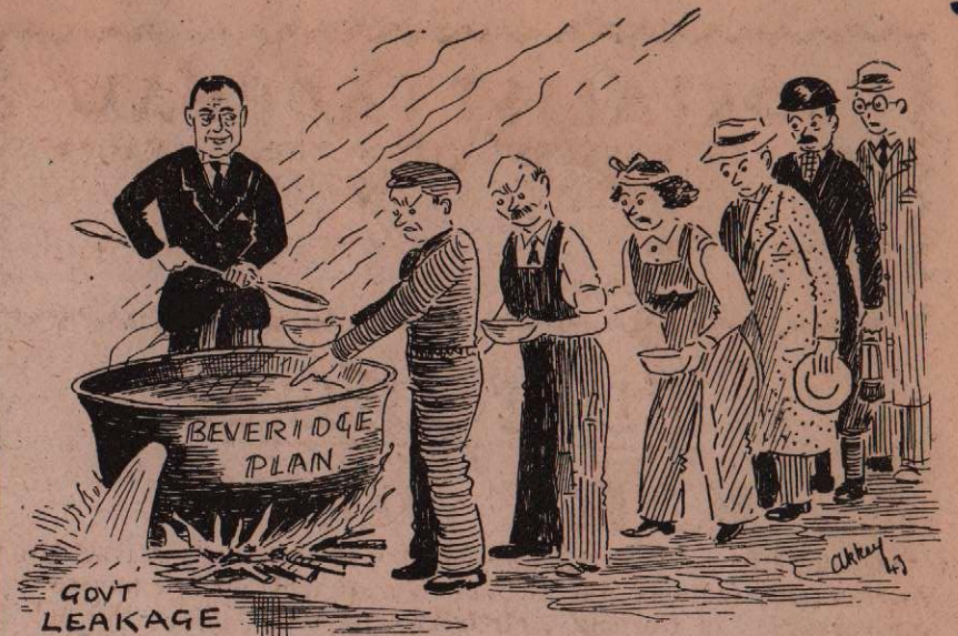
It's Only Water Anyway

Amongst grade after grade the story is the same. Although the T.U. leaders have rejected the capitalist theory of a "ceiling" on wages, in practice they accept it by placing their whole trust in the method of pursuing wage