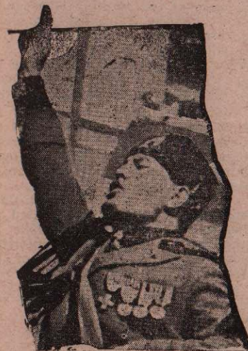
CHURCHILL ON MUSSOLINI IN 1927:

industrial towns, of minor uprisings among the peasants, of mutinies among the Italian soldiers, of demonstrations against the war and against Mussolini, despite the ruthless suppression, in all the big industrial cities. The underground revolutionary opposition had experienced a re-birth throughout Italy. Illegal