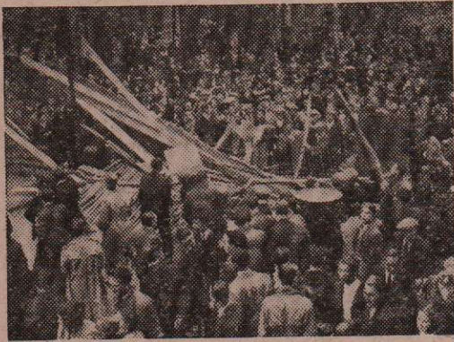
Barricade erected in Long Lane in 1937 by Trotskyists from the Paddington Labour League of Youth and the Stalinists from the Bethnal Green Y.C.L.

Before the outbreak of the war the present Tory leaders in the Government praised both Hitler and Mussolini. Right up to the last moment they tried to reach an agreement with Hitler and Mussolini