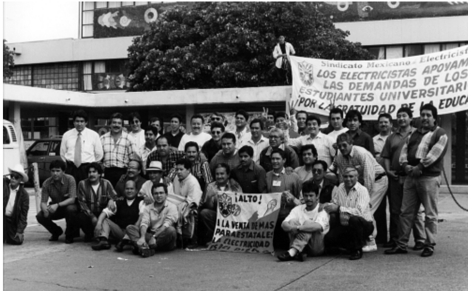
Workers defense guards of the Mexican Electrical Workers Union (SME) at the National University, July 1999. Banner says: "We Electrical Workers Support the Demands of the University Students – For Free Education!"

Let me tell you. There was a strike in Mexico, in the National University of Mexico, that lasted for 10 months, a student strike, from May 1999 until February of 2000. One of the reasons for this strike was they tried to introduce tuition and cut back enrollment at the National University. The students in that strike got hold of a copy of the World Bank report I quoted earlier where it laid out what the consequences were of this movement toward the marketization of higher education. It said, "Radical change, or restructuring, of an institution of higher education means either fewer and/or different faculty, professional staff, and support workers. This means layoffs, forced early retirements, or major retraining and reassignment, as in: the closure of inefficient or ineffective institutions."