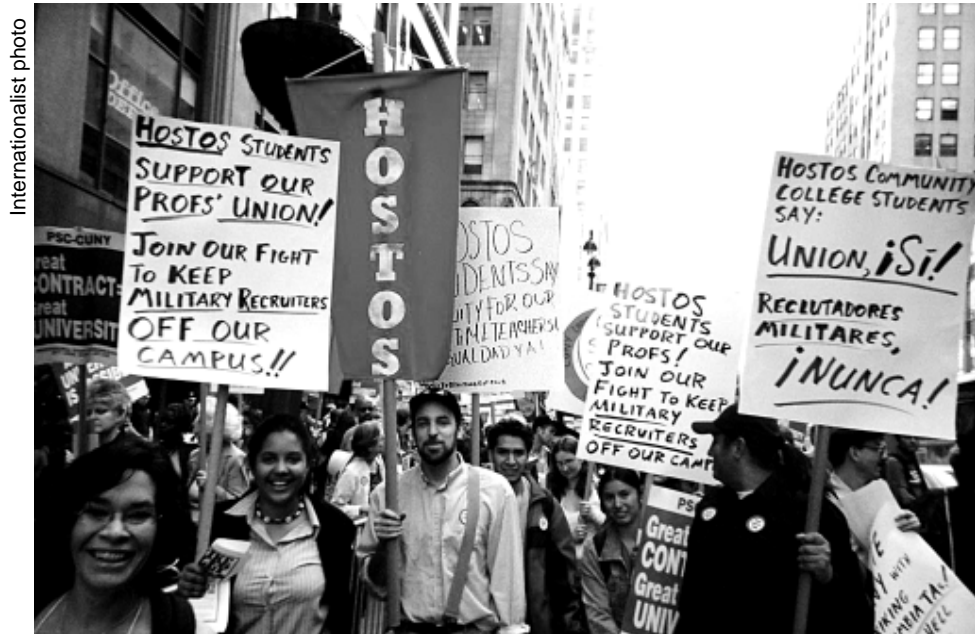
PSC rally in Midtown Manhattan, April 19. A strike by CUNY professors will have to take on and defeat the strikebreaking Taylor Law through mass action.