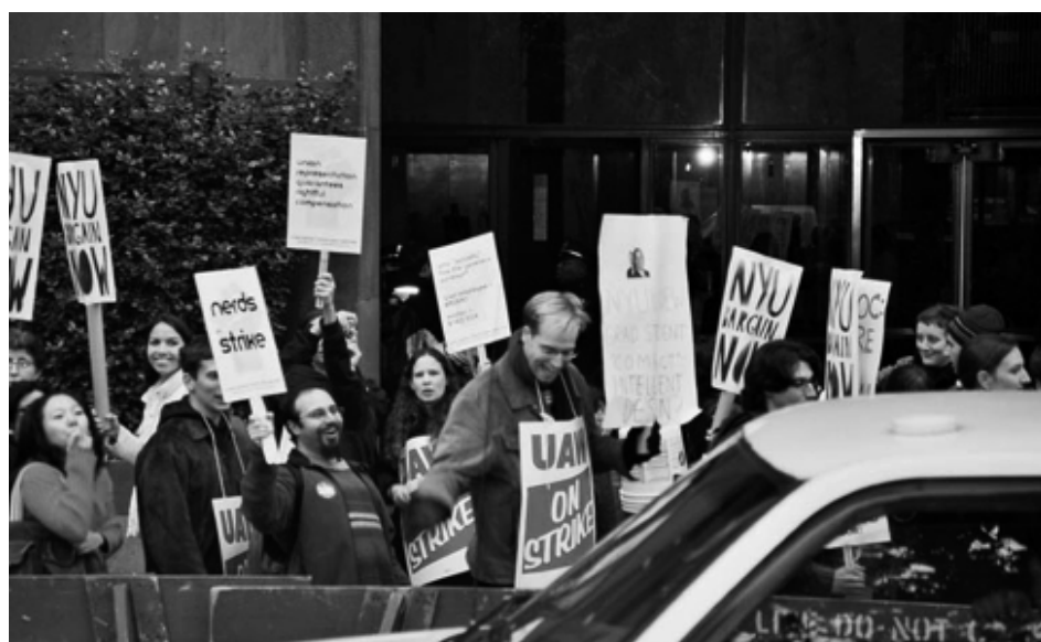
Striking graduate students picket outside NYU’s Bobst Library.

On November 16, a group called Faculty Democracy called a “Town Hall Meeting on the Current Crisis on Campus,” inside NYU’s Silver Building. Many GSOC members asked whether they were supposed to go in, since it is a struck building. To their credit, GSOC picket captains built a large picket line around the building, and most told strikers not to go in.