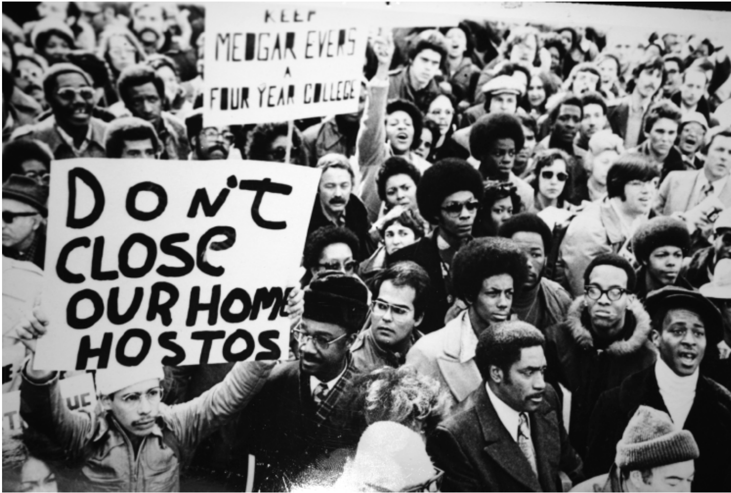
Scenes from demonstrations in winter 1975-76 to keep Hostos and Medgar Evers community colleges open.

was so interesting. The students said that they wanted to have a tour of the building just to see what the building was about.