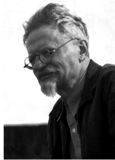
Leon Trotsky in 1940.

"One can't place any confidence in an alliance with the military. You only have to look at Chile and its experience with the Unidad Popular. Salvador Allende kept the working class disarmed and believed up to the last minute that the military would save his government. Then came the repression of the left. We have to arm the working class politically. We communists don't call for national unity, but for taking the class