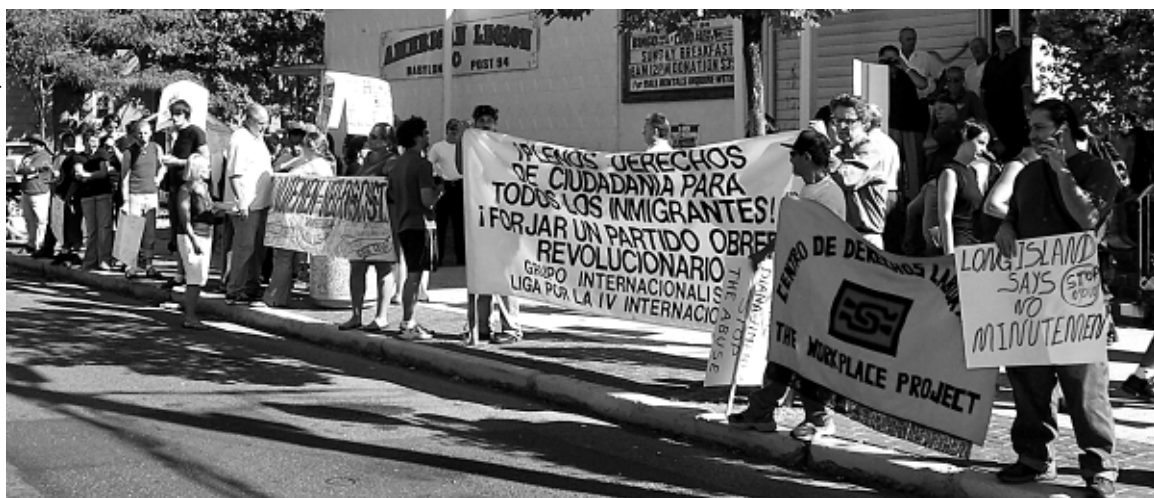
Demonstrators picket Minuteman event in Babylon, Long Island, September 10.