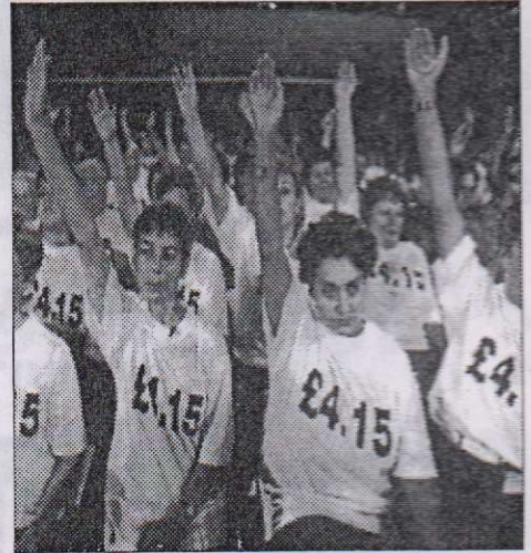
Union delegates voting for a minimum wage

Let's flood the unions with keen and active members - with the very people that are really bearing the brunt of 18 years of the Tories. Let's force the government and the leaders of 'our'