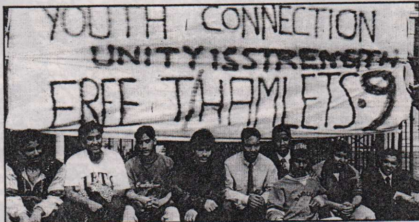
The Tower Hamlets Nine outside Thames Magistrates in Bow

Friday 4 March: benefit concert/rave at the Rocket, University of North London, Holloway Road N7 from 10pm onwards (near Holloway Rd tube)