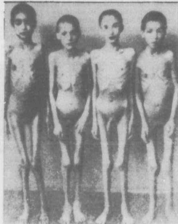
JEWISH VICTIMS OF NAZI TERROR - - -

Since the establishment of Israel some thirty years ago the image of the Jew has un-