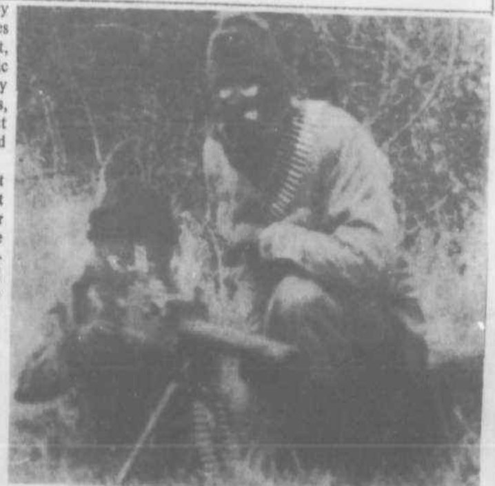
.. WILL ALWAYS LEAD TO THIS