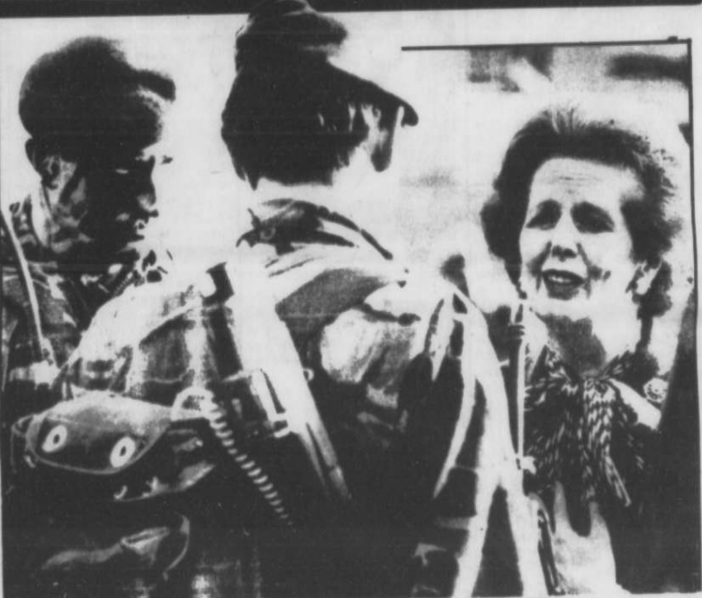
THATCHER, WITH SOME OF HER UNIFORMED CO-CONSPIRATORS.