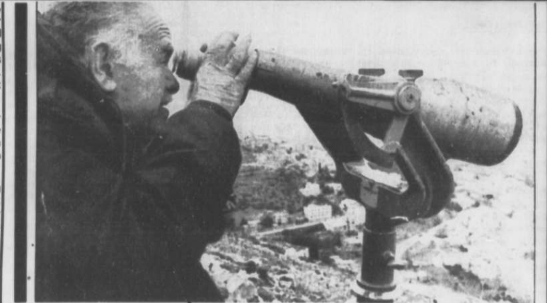
Israeli Prime Minister Yitzhak Shamir, looking for the bombers, or future targets?

Take the Lockerbie plane crash on December 21. A flight from London to New York crashed in the south-west corner of Scotland. Apart from the obvious shock of the number of casualties (and now even more common sight of media voyeurism in episodes such as this) very little seemed to point to anything other than an unfortunate plane crash. Then suddenly the media moguls had a straw to clutch at, most of the victims were our cousins from across the Atlantic, the hint of foul play creeps into the setting. Then the buzz over the next few days as reporters and politicians alike virtually willing the news of terrorist bombs to be revealed. Then bingo. Evidence is found of an explosion causing the crash, its party time for