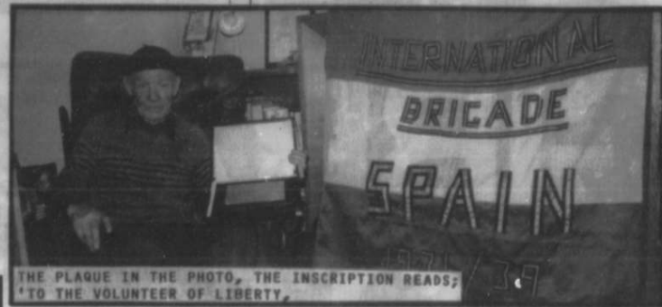
THE PLAQUE IN THE PHOTO, THE INSCRIPTION READS; 'TO THE VOLUNTEER OF LIBERTY.'

'I keep getting asked this question, or the media tries to pursue it, of the idealism. Personally I don't like the word idealism. I don't attribute it to myself because I