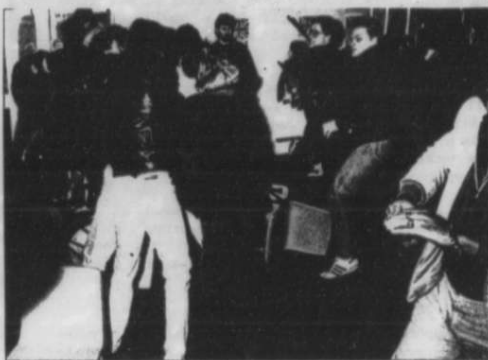
1930's "THEY DID NOT PASS", 1980's "THEY SHALL NOT PASS". THE FIGHT GOES ON. RED ACTION MEMBERS HELP DISRUPT AN NF ELECTION MEETING IN GREENWICH - IN THE TRADITIONAL MANNER. (JANUARY 1987).

Ignoring the nazis only encourages them. It is a sad fact of life that in London you can go down Carnaby Street or Camden Market and see Swastikas openly on sale. This is nothing to do with punk or trying to shock or anything like that. They are on sale alongside Skrewdriver T-Shirts SS badges and other nazi merchandise. It is our lack of opposition that has given them the confidence to move into these areas and we are not prepared to let this go unchallenged. Having nazi symbols on display encourages the growth of nazi politics.