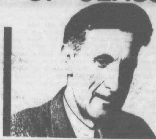
GEORGE ORWELL. SOCIALIST, SNOB OR BOTH ?

Most socialists will have read and admired some of the work of George Orwell. It is well known that his background made him an unlikely figure on the political left. He was born in India in 1903, the son of an official in the Indian Civil Service with distant aristocratic connections. Early on he moved to England, attending a private boarding school and then Eton. He wrote of himself "I was both a snob and a revolutionary. I loosely described myself as a socialist" even though he had "no notion that the working classes were hum an beings"