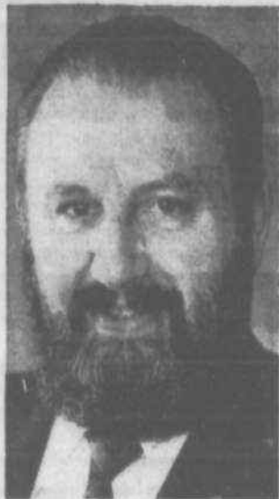
James Anderton, Chief Constable of Manchester, reincarnation of Oliver Cromwell and out and out head case

Along with sporting biblical beards, they also shared something else in common. A contempt for prostitutes and others who they consider to be morally degenerate. Whilst Anderton employs the blunt instrument of the Manchester Police to right moral wrongs, and has so far restricted himself to violent rhetoric and the odd Sado-Masochist fantasy "I would have people flogged until they begged for mercy" he once said, Sutcliffe took more direct action, using an engineers hammer to eradicate those he considered to be God's and society's problem.