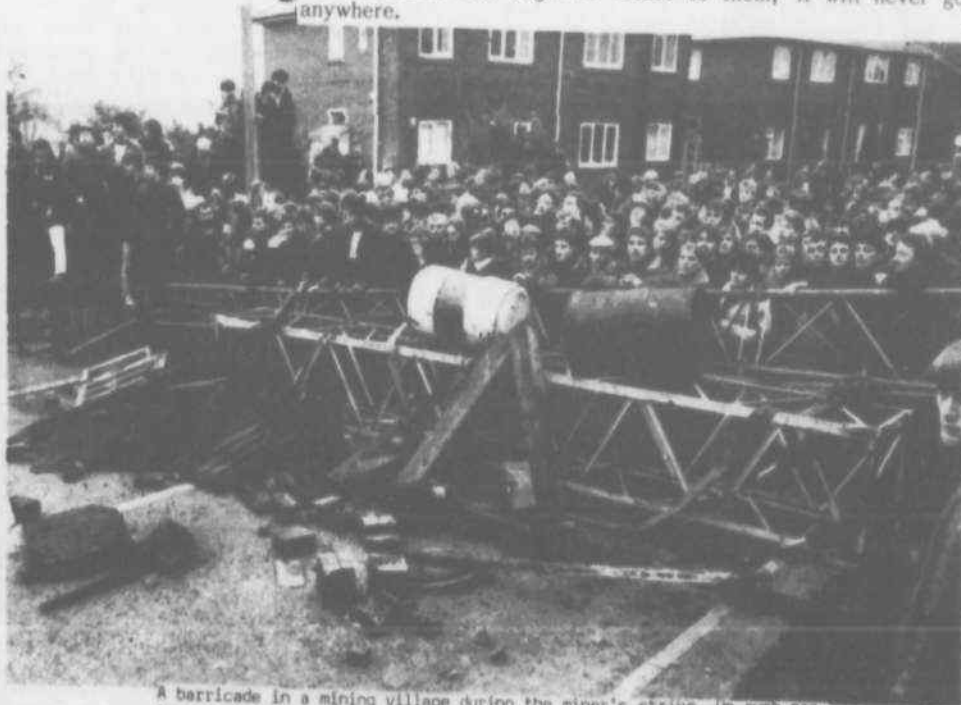
A barricade in a mining village during the miner's strike. In such people and on such tactics the militant working class movement will be built

As for the argument that such activity doesn't win strikes we would be quite justified in arguing back that the more traditional methods don't seem to be enjoying to much success at present either. In any case, as revolutionary socialists we do not judge strikes merely in terms of whether they win or lose in the immediate sense. We know that as long as the capitalist system exists, anything won today may be lost back tomorrow. Therefore we also judge strikes in terms of the role which they play in raising the political consciousness of those involved. And who's consciousness can have been raised more during a strike, than those who in support of it, are willing to become involved in activities which they know may cost them their freedom. Such people represent the vanguard of any future working class movement. Unless the revolutionary movement can begin to relate to them, it will never go anywhere.