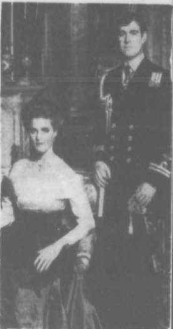
Another mouth for us to feed, The latest recruit to the Royal Gravy Train

It is quite true that tourism does bring in a lot of money to this country, but people would still come to see the sights of London whether the Monarchy existed or not, just as they do in countries like Italy and France and many other countries which have no Monarchy but which are still great tourist attractions.