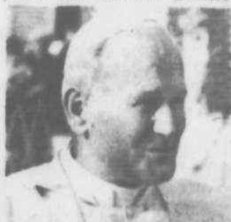
Like the Mafia, the Catholic Church has it's roots in Italy, and also like it, it is one of the largest financial concerns in the world.