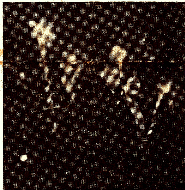
Another section of the torchlight demonstration to Grosvenor Square