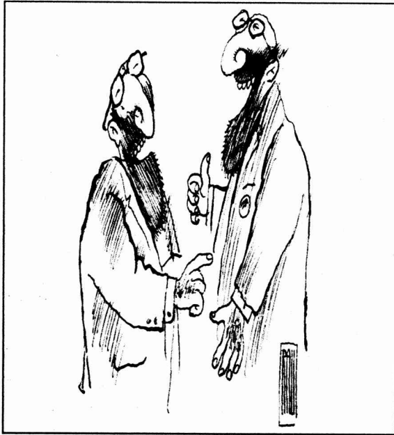
An antisemitic cartoon in a recent issue of Magyar Fórum