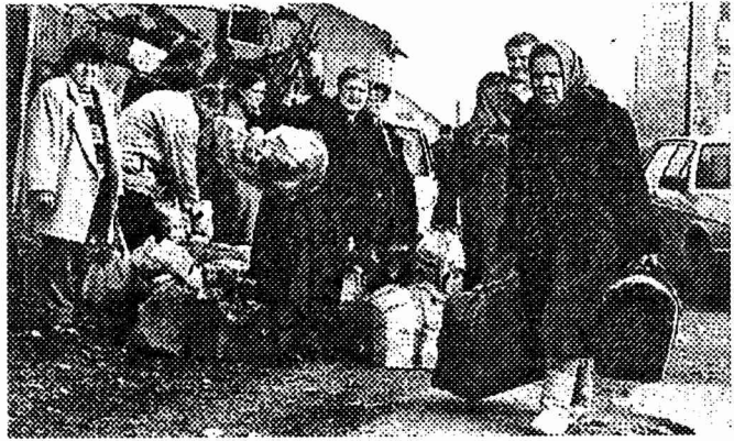
Refugees from the war in Bosnia

EC measures: The Minority Rights Group, in its 1992