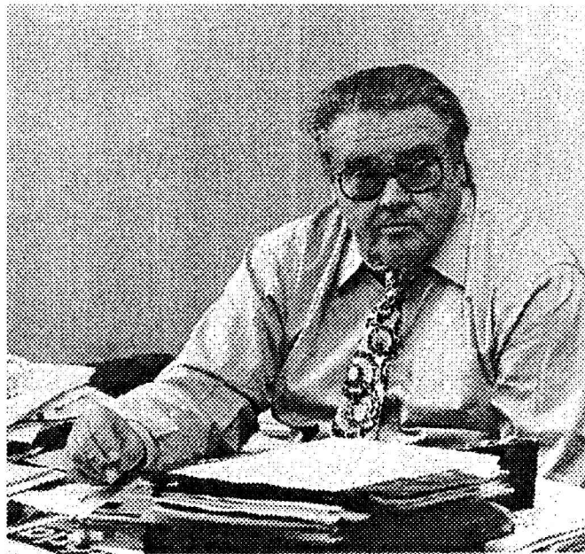
MDF leader, István Csurka

Since, in the latest period, these two tendencies have dominated the political scene, the chances for democracy have been dramatically reduced. A renewal would be very difficult without a massive change in popular sentiment. Increased activity on the part of civil society would be a necessary precondition for any kind of democratic development. Seeing the passivity of the masses in Hungary after the elections of 1990, the new government gave a clear message that it had little interest in