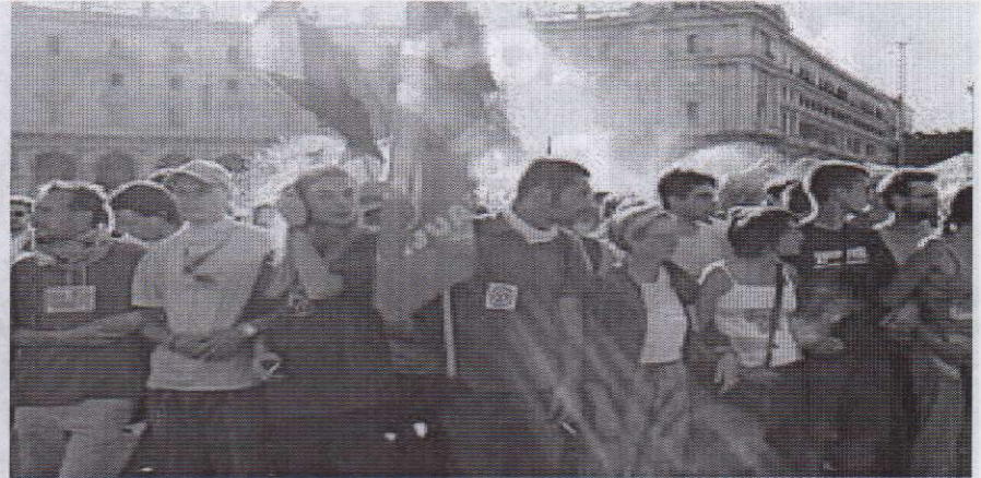
Rome, July 24th: a youth camp delegation joins a demonstration against the repression in Genoa

On the other hand, notably in Italy but also in the Spanish state and France, this movement had already begun to involve youth. In the few months between April and the camp (in July) it could be seen that the movement had developed at great speed and even if our comrades from Portugal formed the only organized delegation from their country