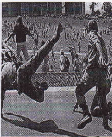
Police attack energy protest

The PT is the main beneficiary of the resistance to the neoliberal program developed by the left and the mass movement. The party's candidate will be