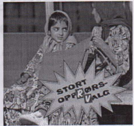
REA election poster

The lack of vision, more concretely the lack of major reforms to the benefit of ordinary people; the lack of willingness