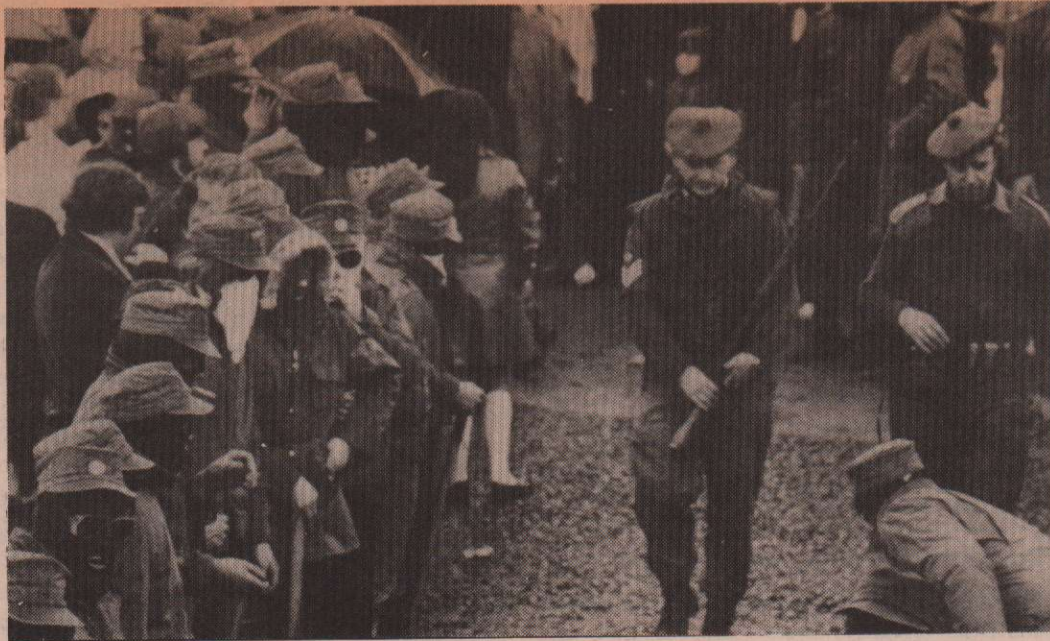
British army and masked UDA men

The 'operations' referred to were a series of sectarian killings, including the killing of two Catholic brothers and their pregnant sister in Tyrone. Members of the 'security forces', especially the UDR, have also themselves carried out many terror attacks on Catholics. UDR members were heavily involved in a series of loyalist murders in Co Tyrone and Co Armagh in 1974 and 1975. In May 1974 a member of the 8th Battalion of the UDR machine-gunned a Catholic man and his wife to death at their home in Co Tyrone. In August 1975 members of the UDR carried out the massacre of three members of the Miami Showband, a southern group whose members were ambushed when returning to the 26 Counties. The three were killed and two wounded after the five band members had been lined up and machine-gunned down. Two of the loyalist gang were killed in a premature explo-