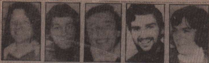
Bobby Sands Francis Hughes Raymond McCreesh Patsy O'Hara Joe McDonnell