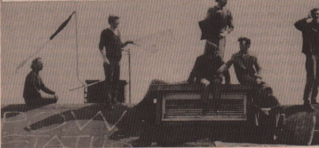
Gartree prison protest, July 1978

On 6 December 1975 they were surprised by the police while raking Scotts Restaurant Mayfair with bullets. Knowing the fate that awaited them – beatings or indeed murder – they decided to surround their arrest with maximum publicity by entering a house in Balcombe Street and taking a married couple hostage. On 12 December having achieved their purpose they surrendered.