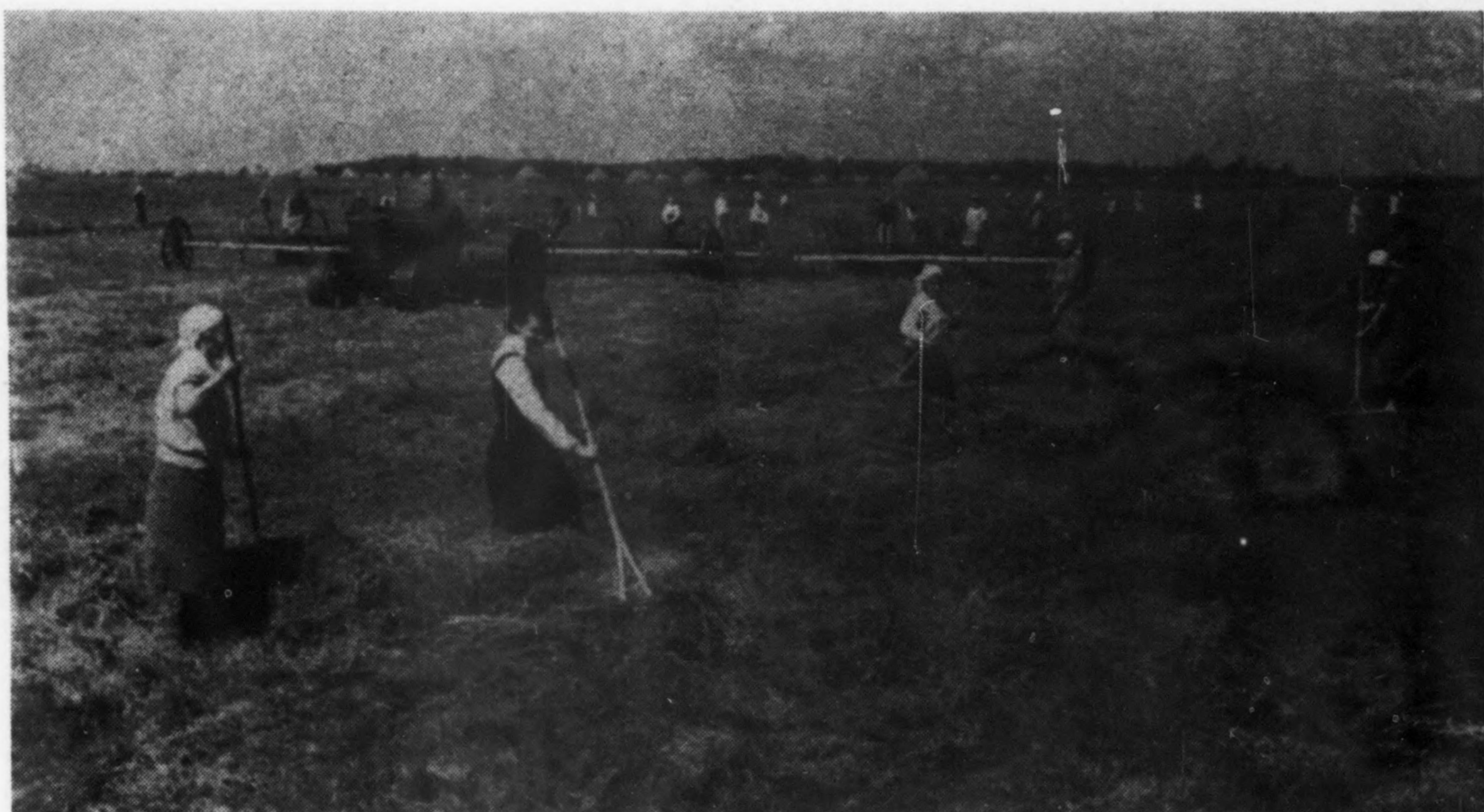
Harvesting the grain on a large collective farm in the Kiev region of the Ukraine

Agriculture in the Soviet Union has been subject to the same thorough revision and development as industry. In fact, the metamorphosis which has taken place in the outlook of the great mass of Asiatic peasants and nomads is perhaps greater than that of the industrial worker. For it must be remembered that where the principle of private property obtains every peasant is a potential landlord. Therefore, the effort to collectivize the land, so essential to the Soviet regime with its socialist objective, met with considerable sabotaging opposition from the wealthier peasants (kulaks), particularly as the circumstances forced its adoption by ruthless