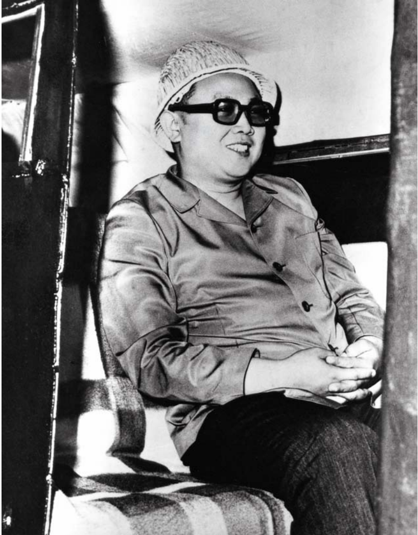
Kim Jong Il giving on-the-spot guidance at the Komdok Mine (July 1, 1975)