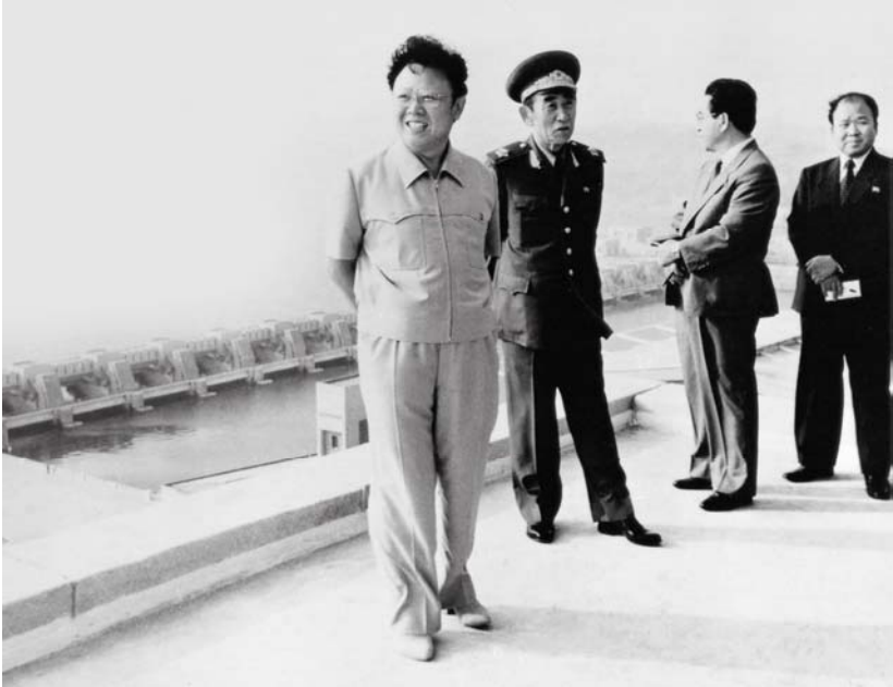
Kim Jong Il inspecting the West Sea Barrage (June 23, 1986)