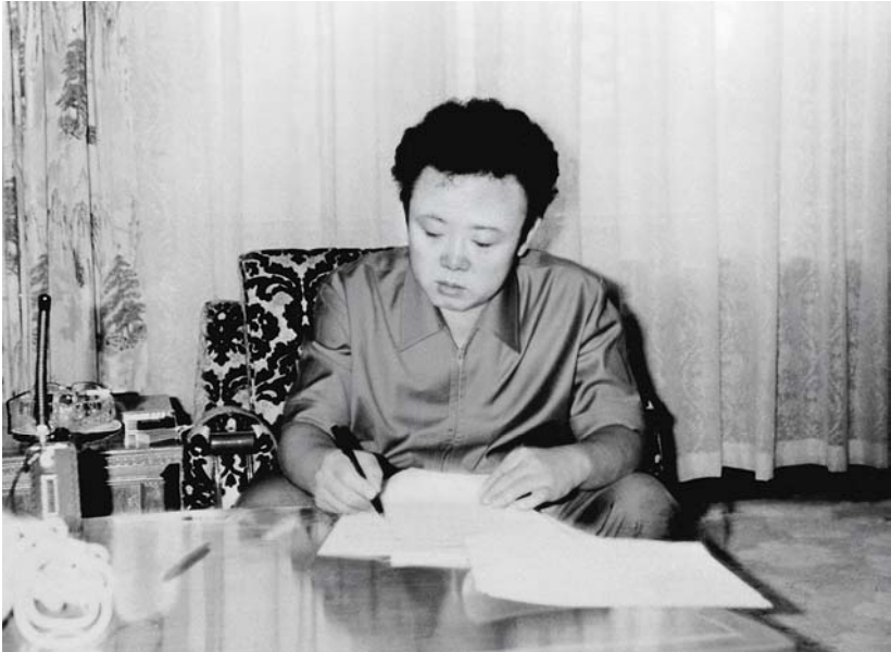
Kim Jong Il writing a treatise