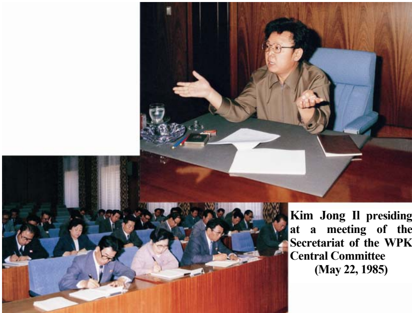
Kim Jong Il presiding at a meeting of the Secretariat of the WPK Central Committee (May 22, 1985)