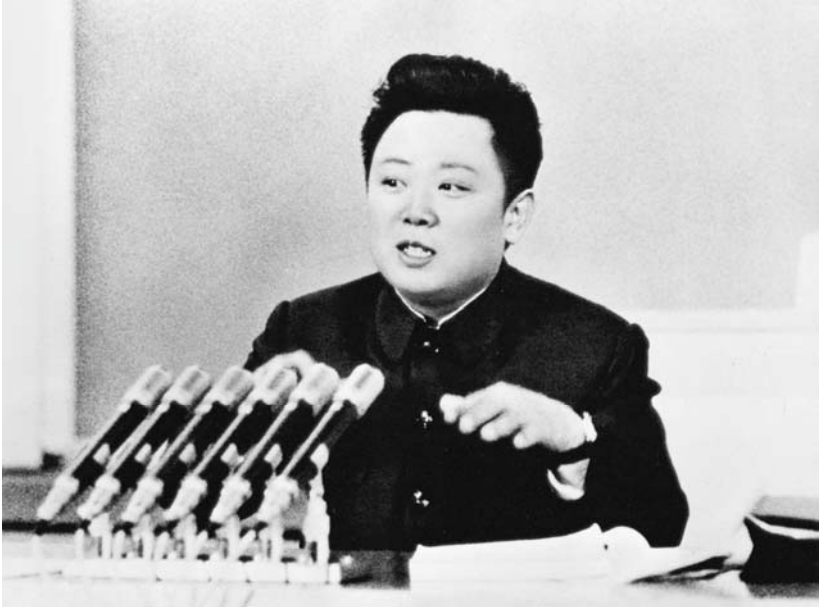
Kim Jong Il concluding the National Training Course for Party Information Workers (February 19, 1974)